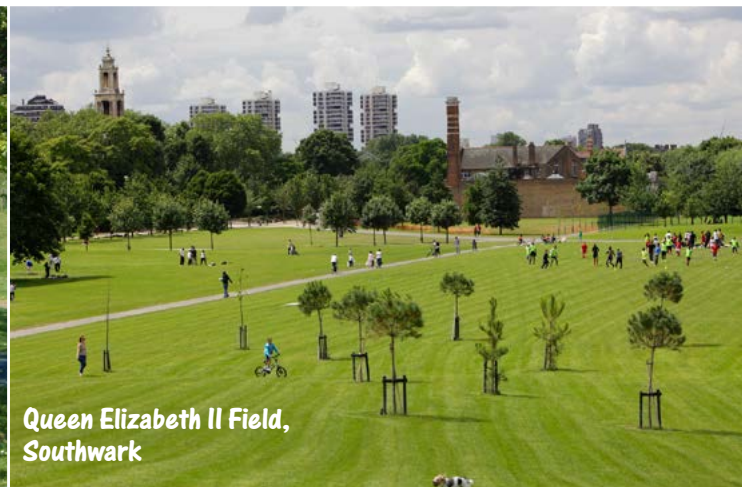
Queen Elizabeth II Field, Southwark