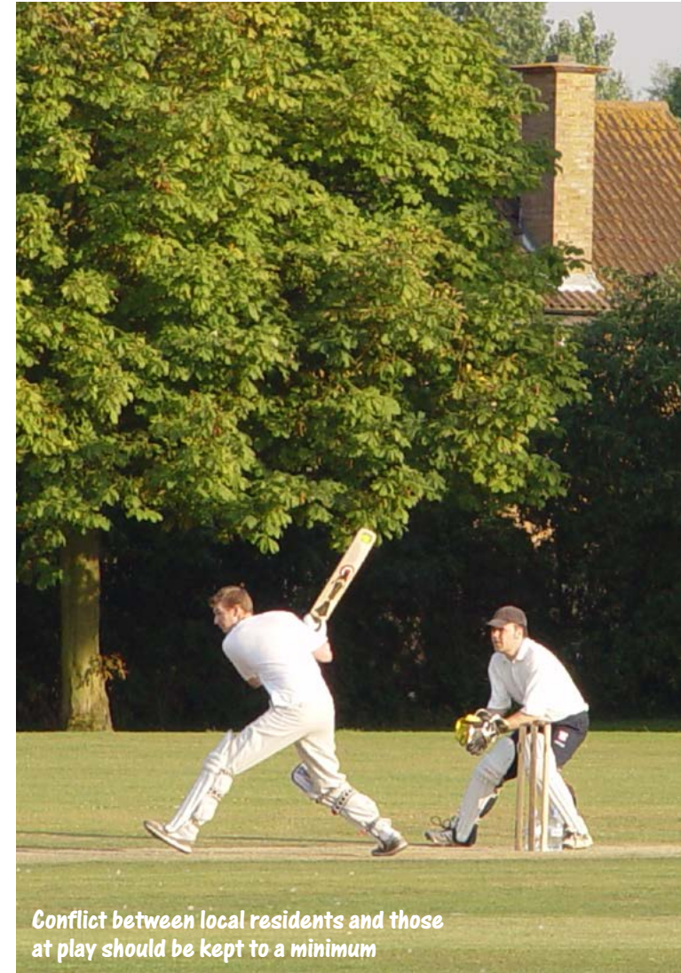
Conflict between local residents and those at play should be kept to a minimum

A suitable relationship can be created by using the minimum buffer zones for specific facilities. These off-set distances ensure that facilities do not enable users to overlook neighbouring properties, reducing the possibility of conflict between local residents and those at play.