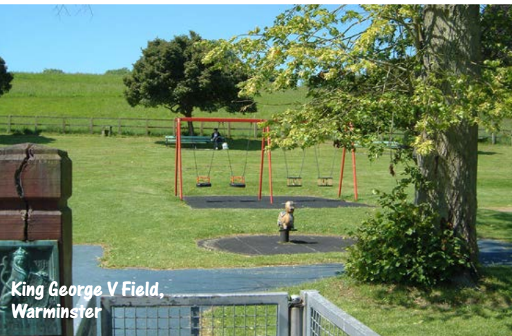
King George V Field, Warminster

A review of current national planning policy and guidance related to open space provision can be found here .