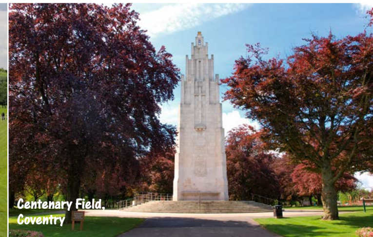
Centenary Field, Coventry