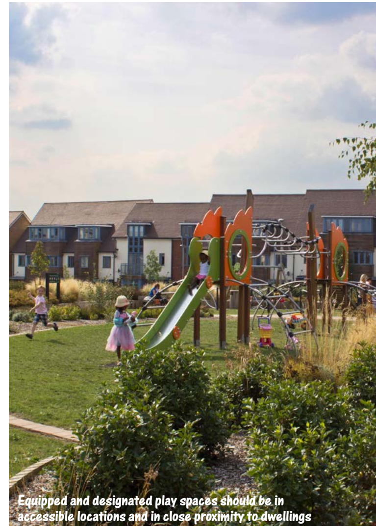
Equipped and designated play spaces should be in accessible locations and in close proximity to dwellings

Definitions can be found here for the open space and equipped/ designated play area typologies.