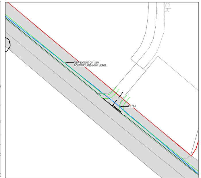
SITE ACCESS JUNCTION @ 1:1250 SCALE