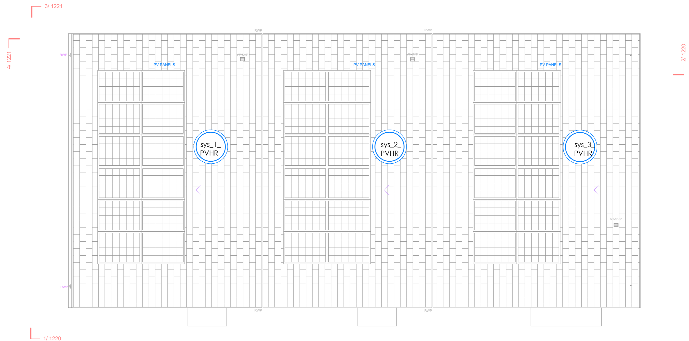
Building B43_first floor