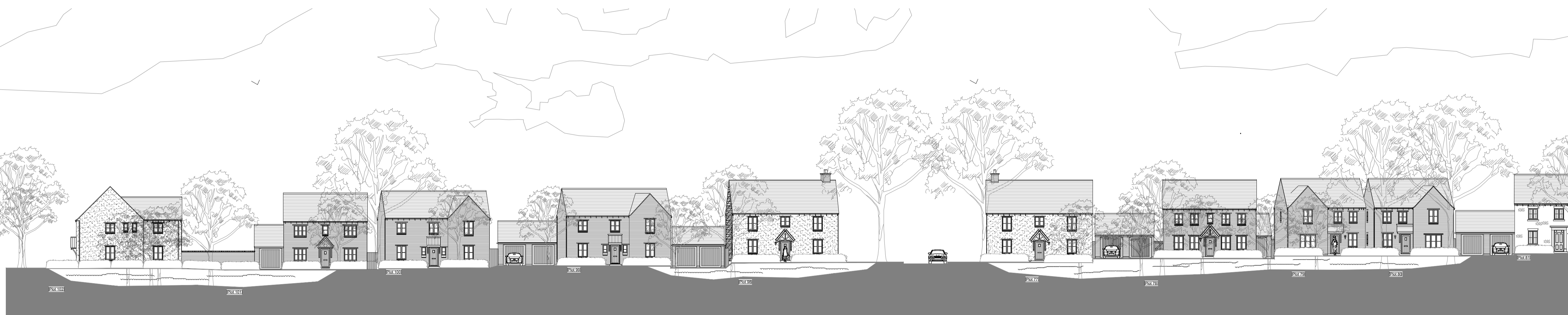
Street Scene D1