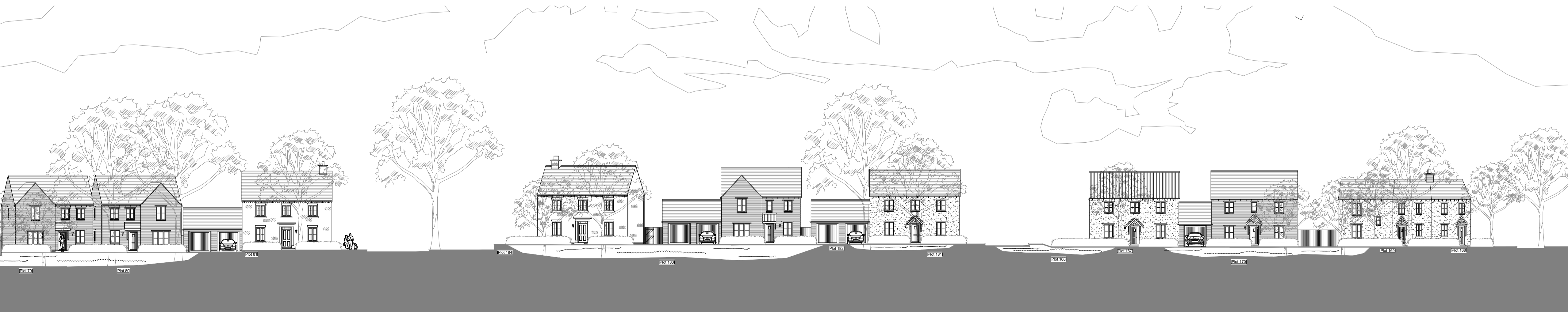
Street Scene D2