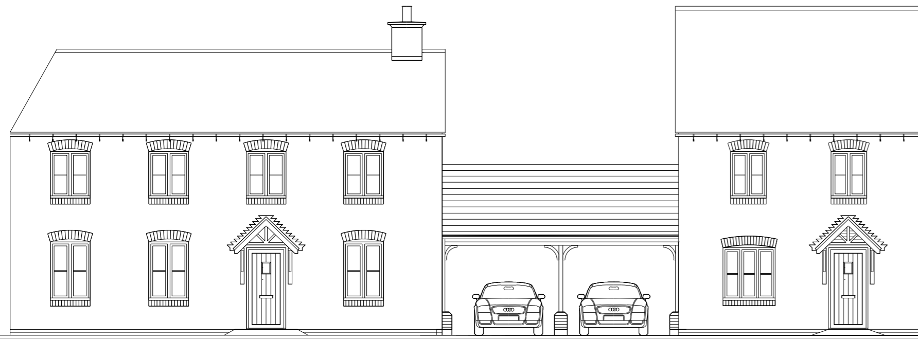
Front Elevation Plots 217,237,238 & 239