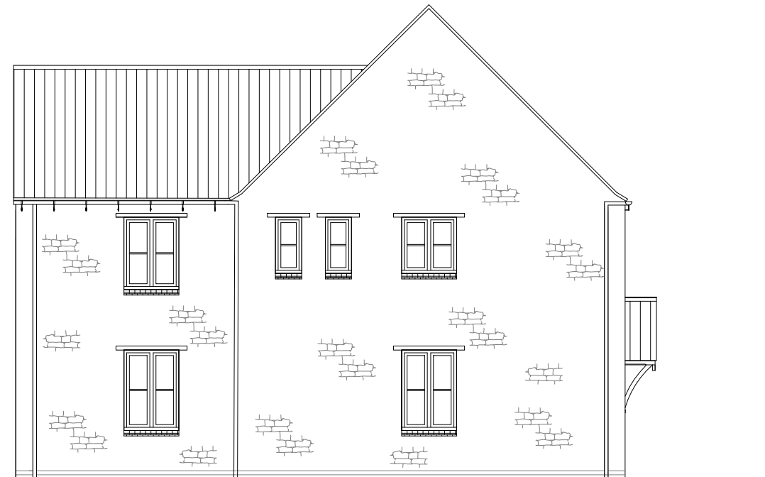
FRONT ELEVATION 2