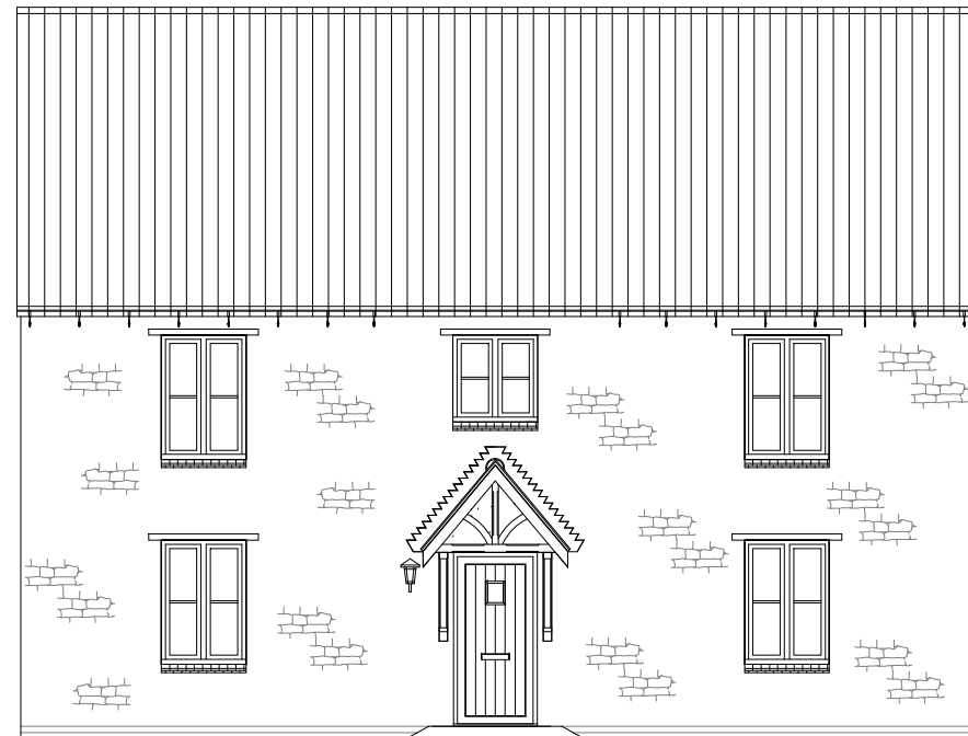
FRONT ELEVATION 1