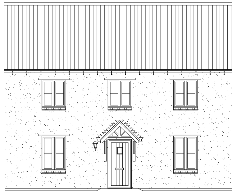
FRONT ELEVATION 1