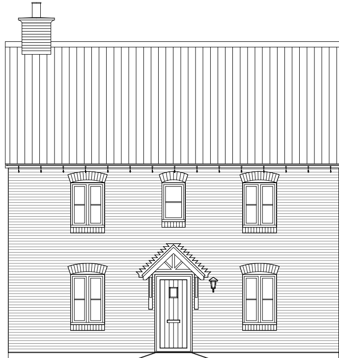
FRONT ELEVATION 1

GRP chimneys apply to selected plots only, please refer to the Materials layout.