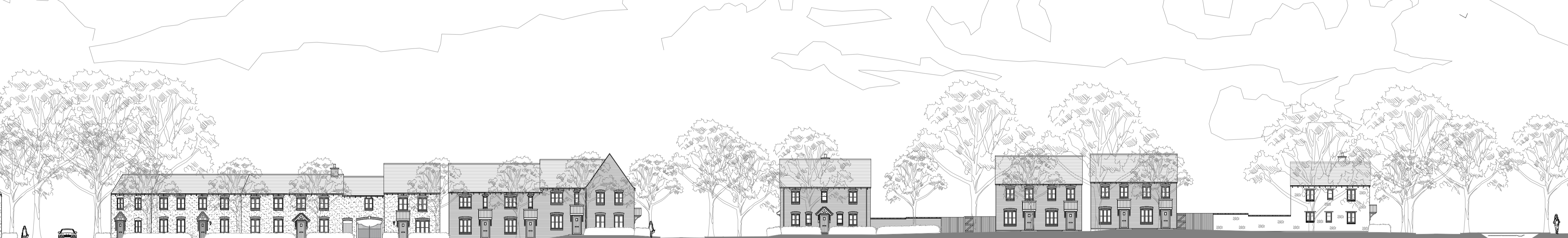
Street Scene H2