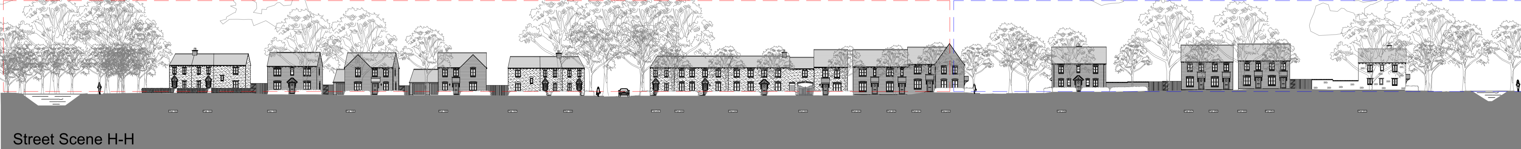
Street Scene H-H