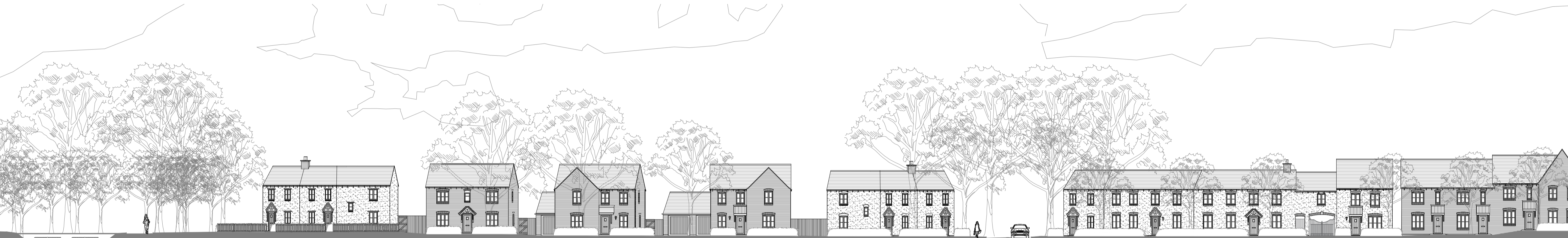
Street Scene H1