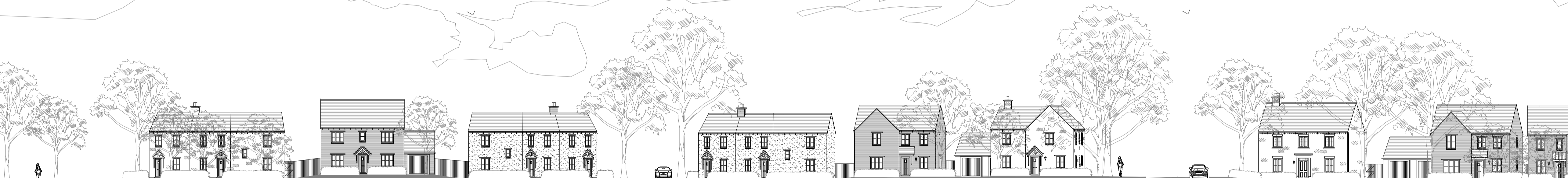
Street Scene F2