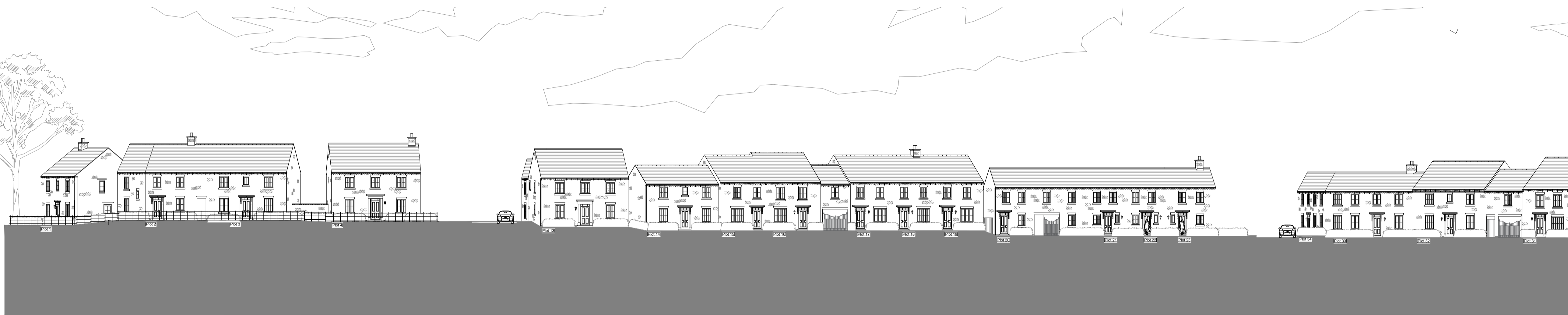
Street Scene B1