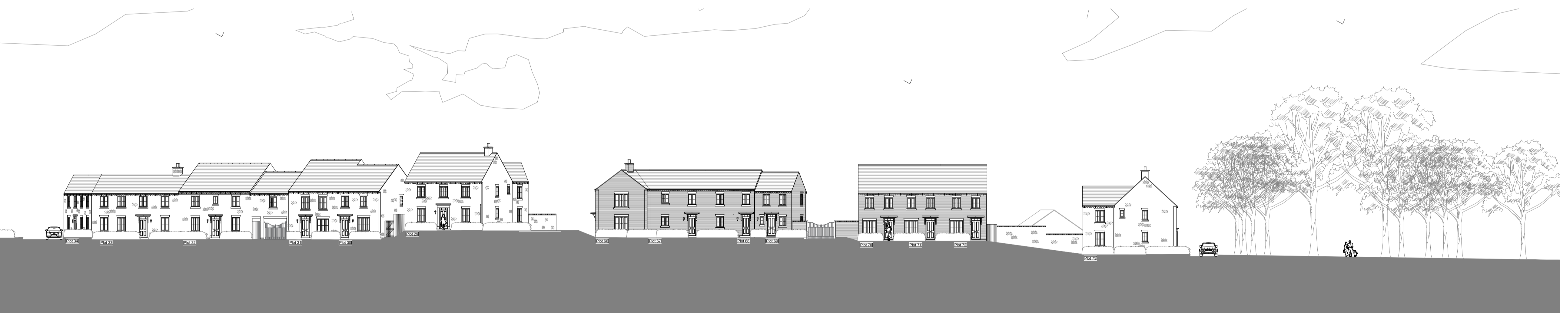
Street Scene B2