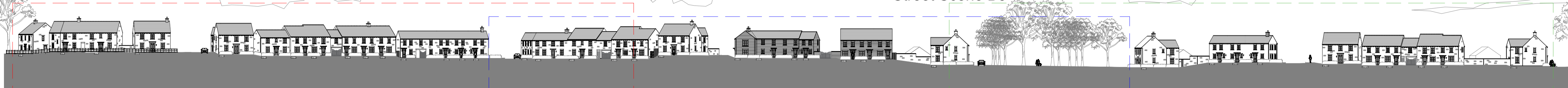
Street Scene B-B