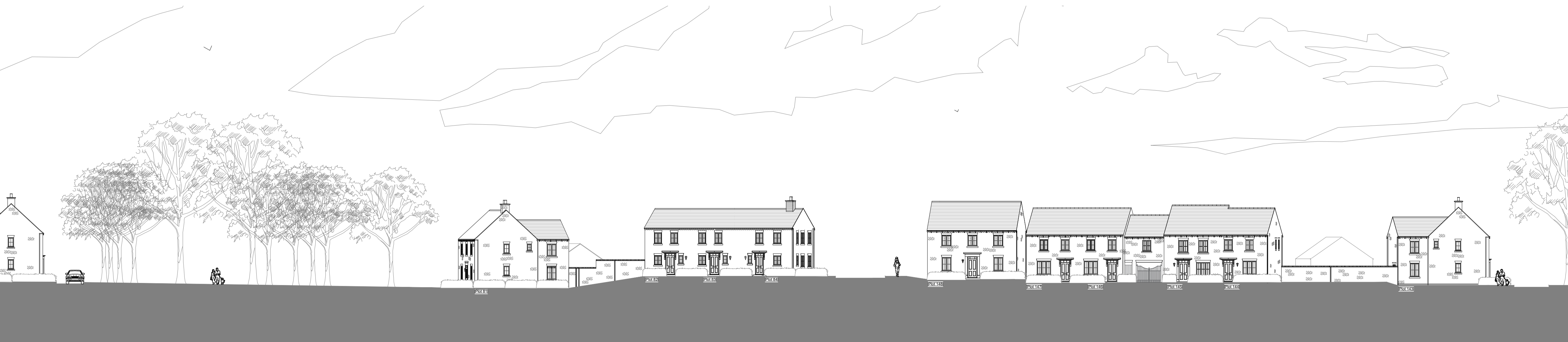
Street Scene B3