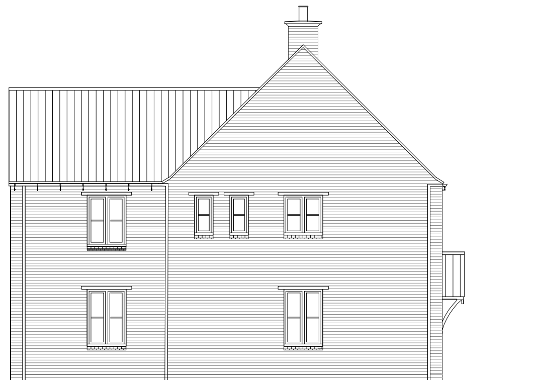
FRONT ELEVATION 2