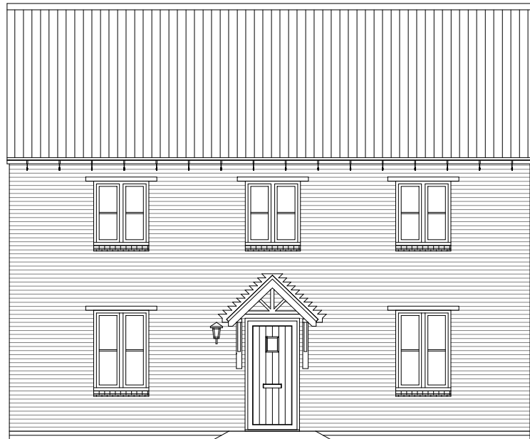
FRONT ELEVATION 1