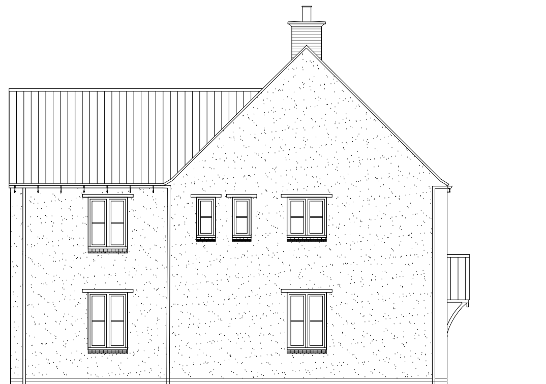
FRONT ELEVATION 2