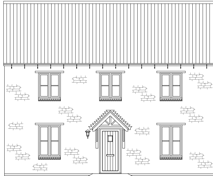
FRONT ELEVATION 1