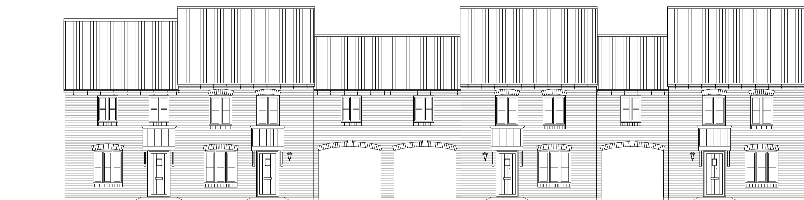
P382 FRONT ELEVATION