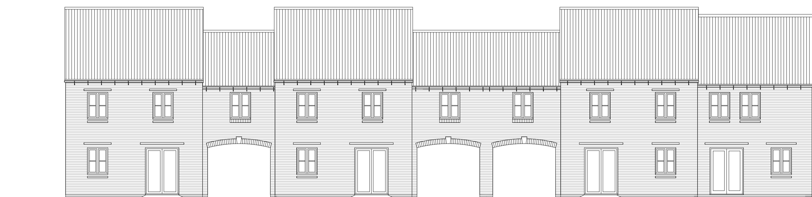
The Bloxham REAR ELEVATION