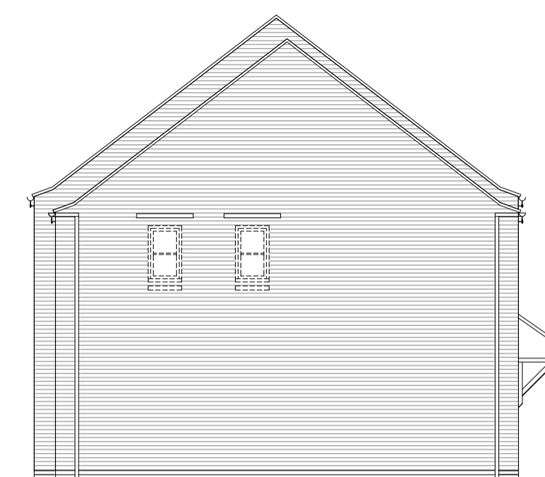
P382 SIDE ELEVATION