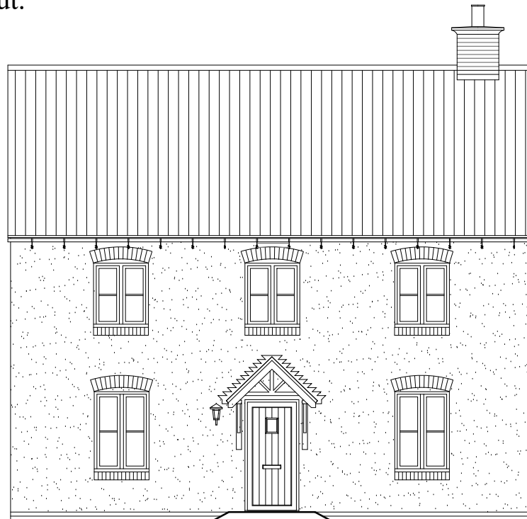
FRONT ELEVATION 1