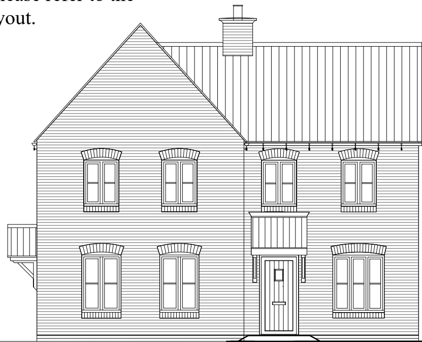
Type 55 FRONT ELEVATION