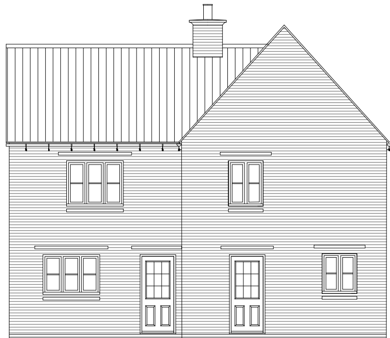
Type 50 REAR ELEVATION