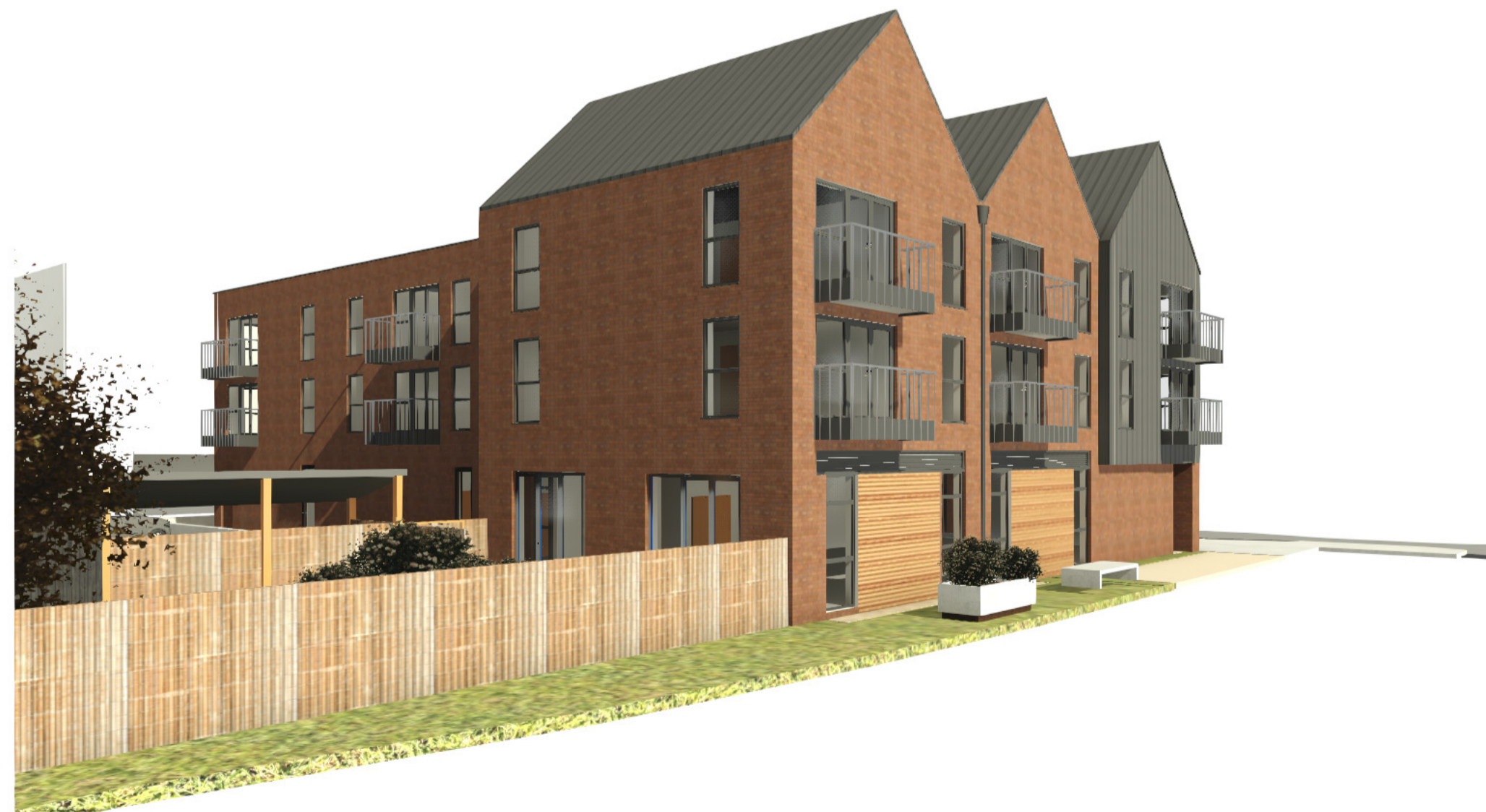
2 Rear View