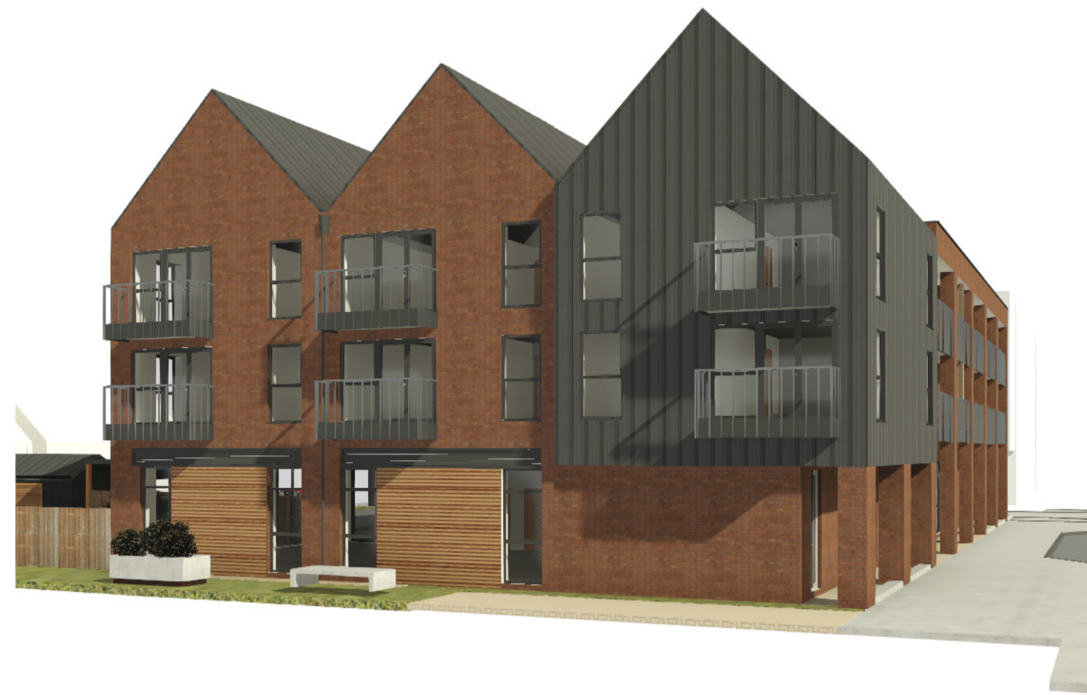
5 Side View 1

NOTES: The contractor is responsible for checking dimensions, tolerances and references. Any discrepancy to be verified with the Architect before proceeding with the works. Where an item is covered by drawings to different scales the larger scale drawing is to be worked to. Do not scale drawing. Figured dimensions to be worked to in all cases. The structural / civil engineering and other non-architectural information shown on this drawing is purely for co-ordination purposes only and in no way does it take on any responsibility or liability for MBA Ltd. For all detailed information relating to these items see the relevant consultants drawings and full design information. Do not copy in full or in part without the expressed consent of MBA Ltd. © MBA 2020