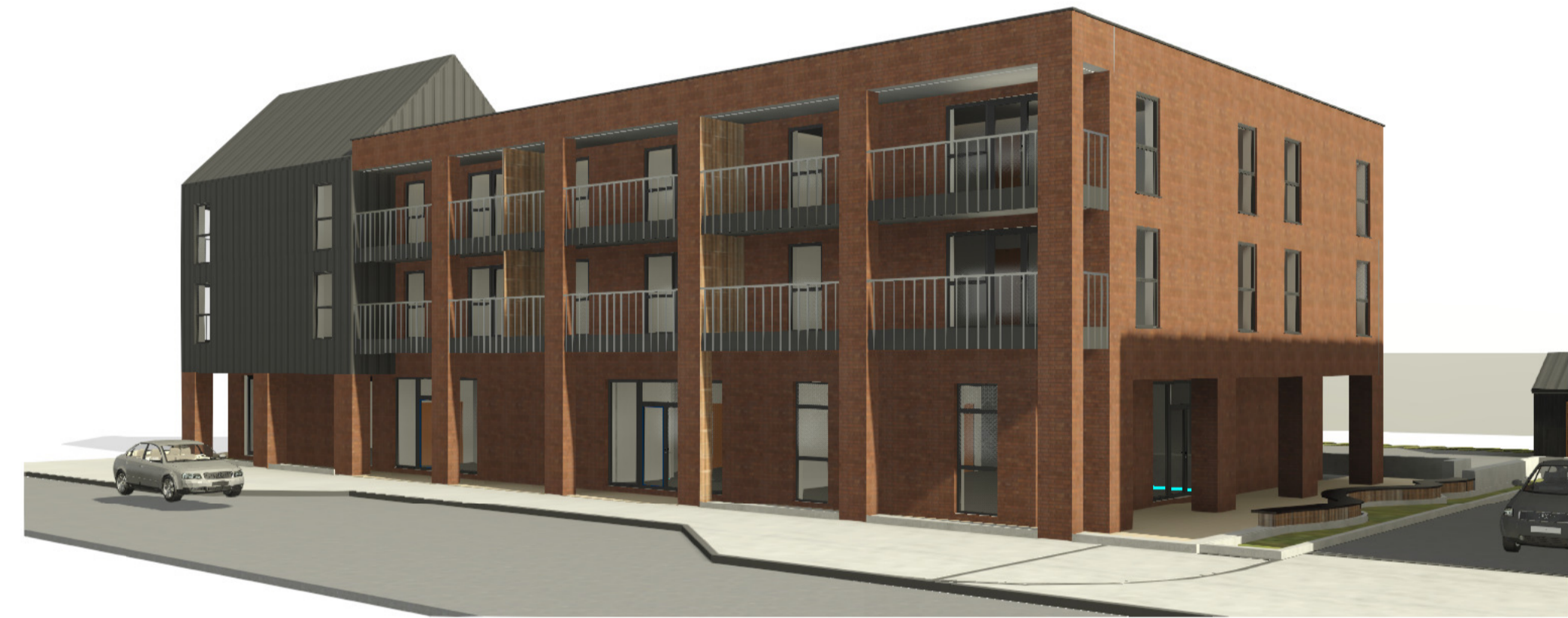
1 View from Road