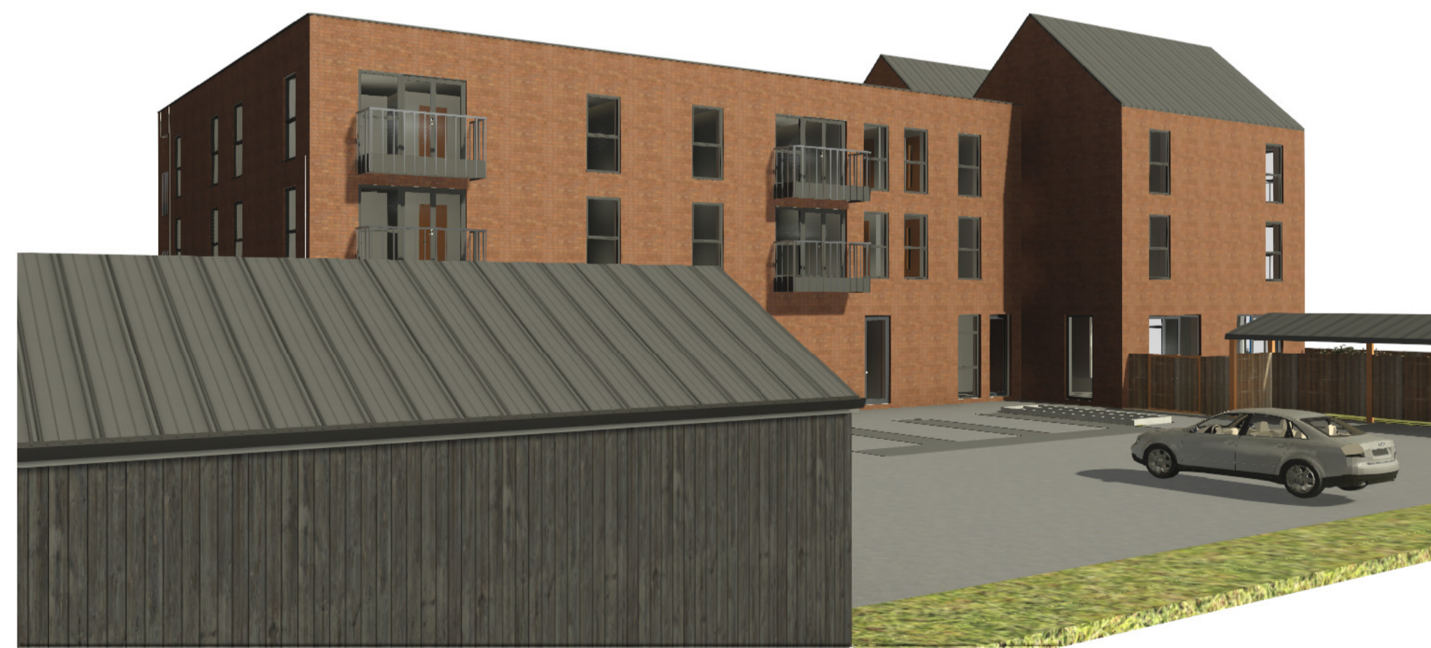
3 Rear View 2