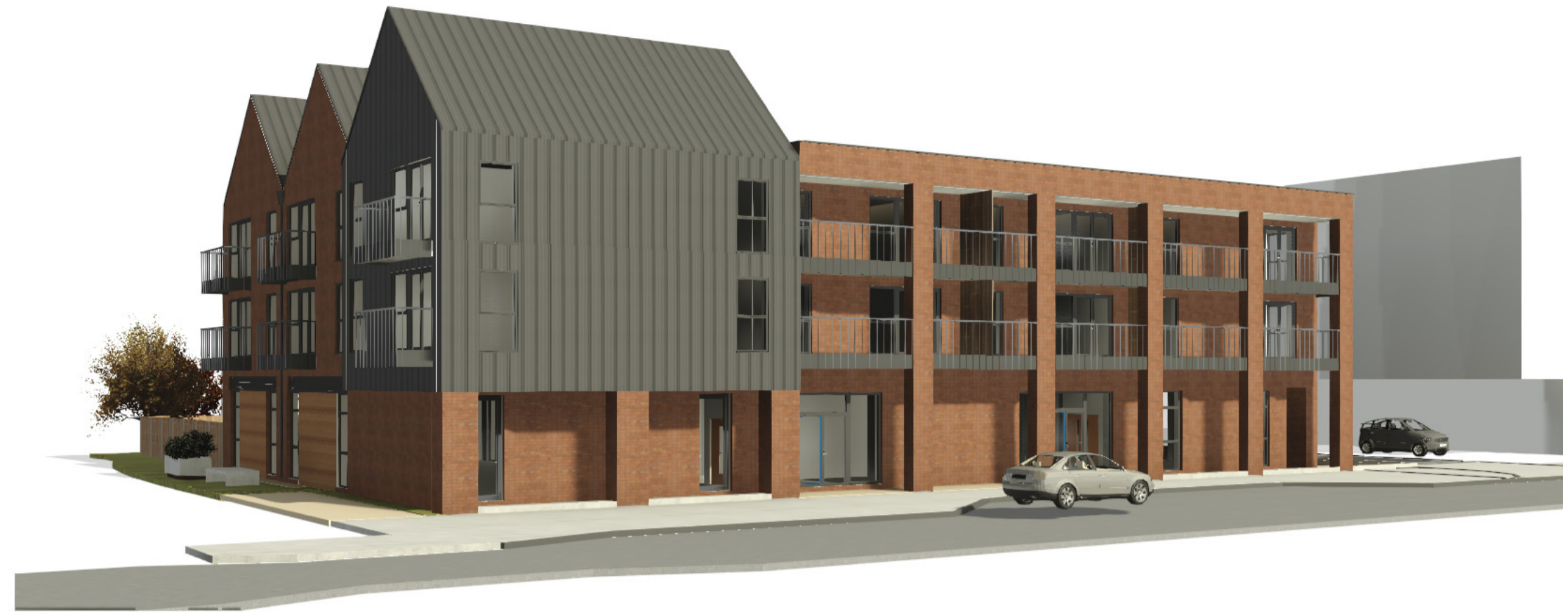
4 View from Road 2