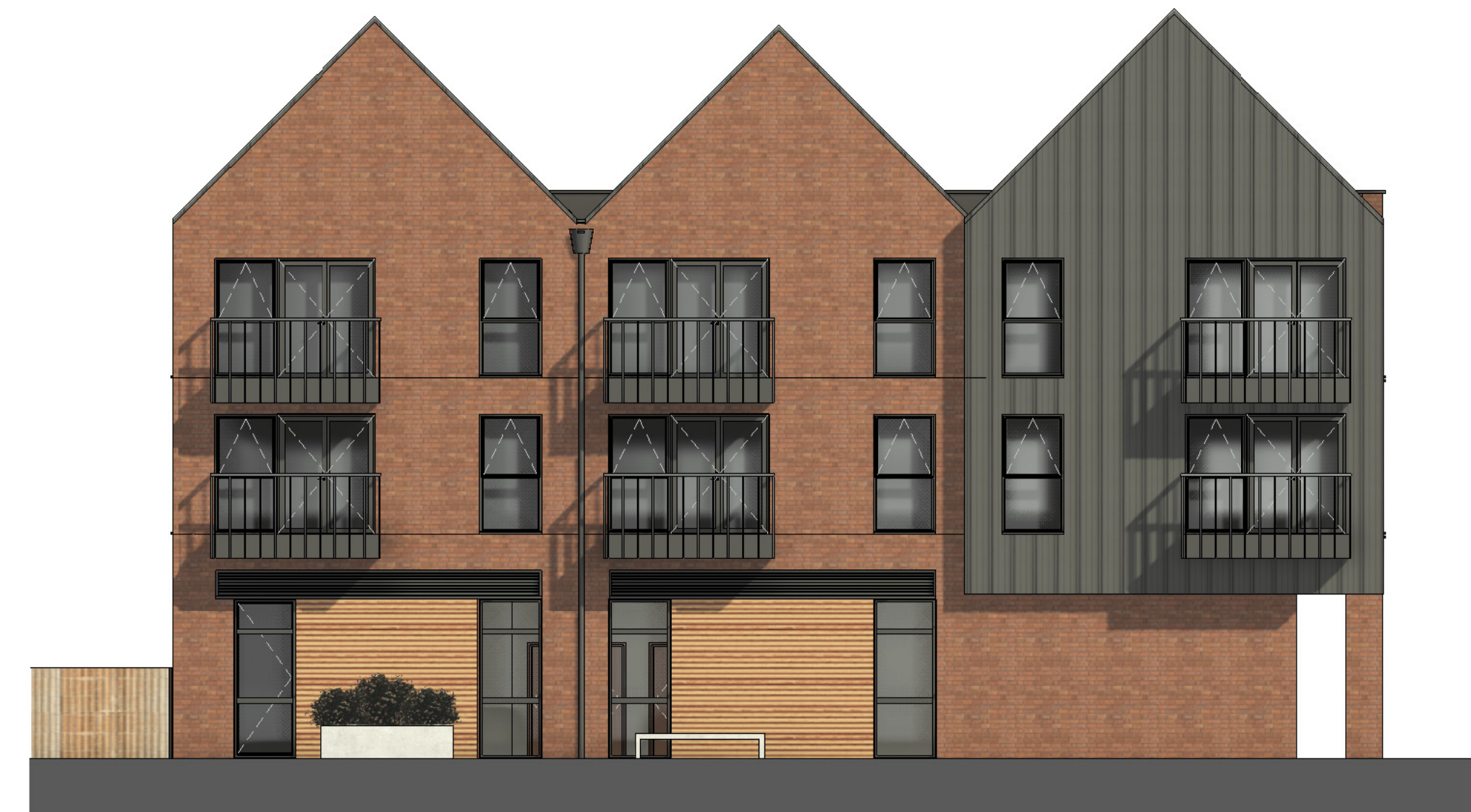
4 West Elevation 1 : 100