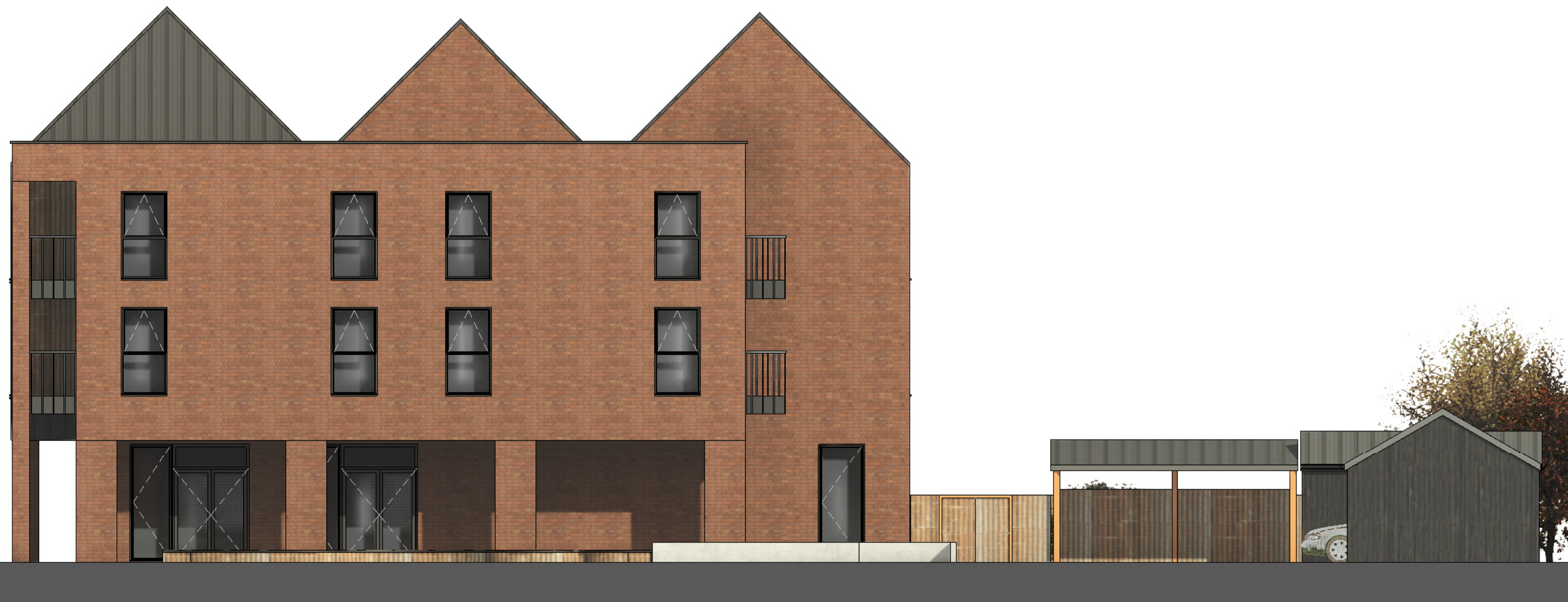
1 East Elevation 1 : 100