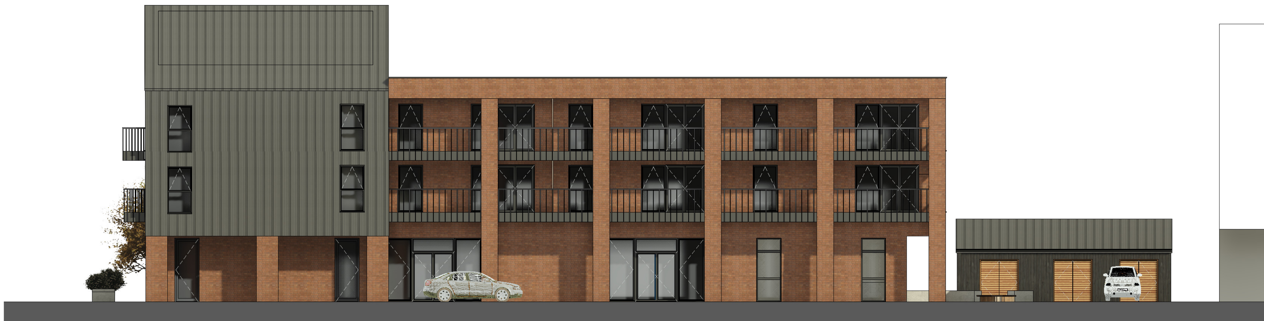
3 South Elevation 1 : 100