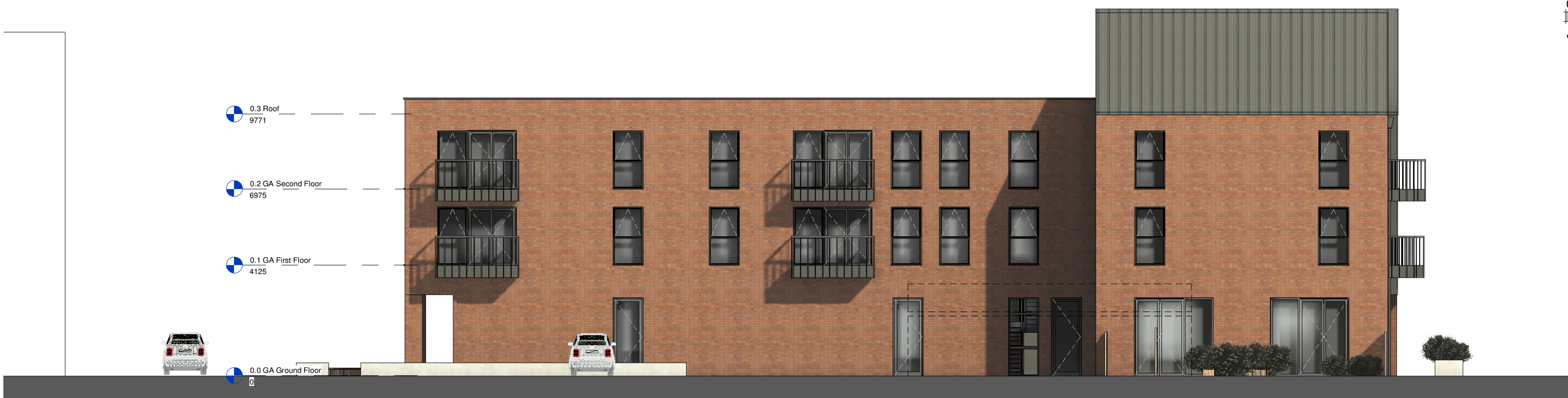
2 North Elevation 1 : 100