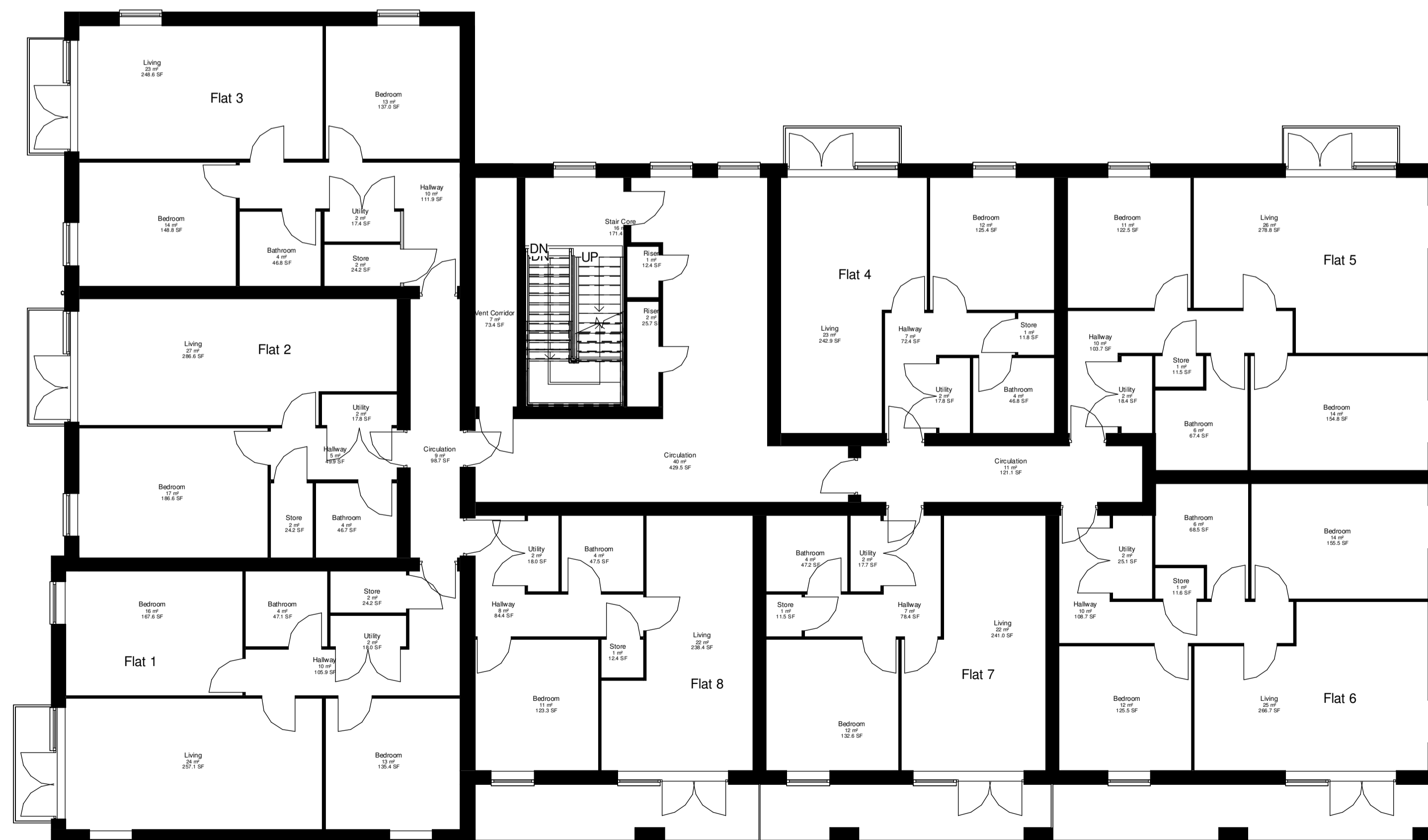
2 0.1 First Floor Plan 1 : 100