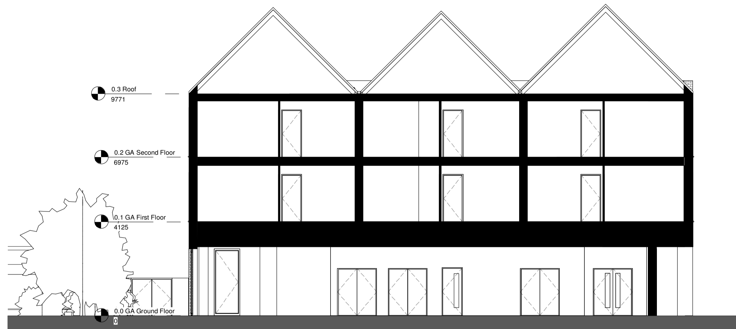
1 Section A-A 1 : 100