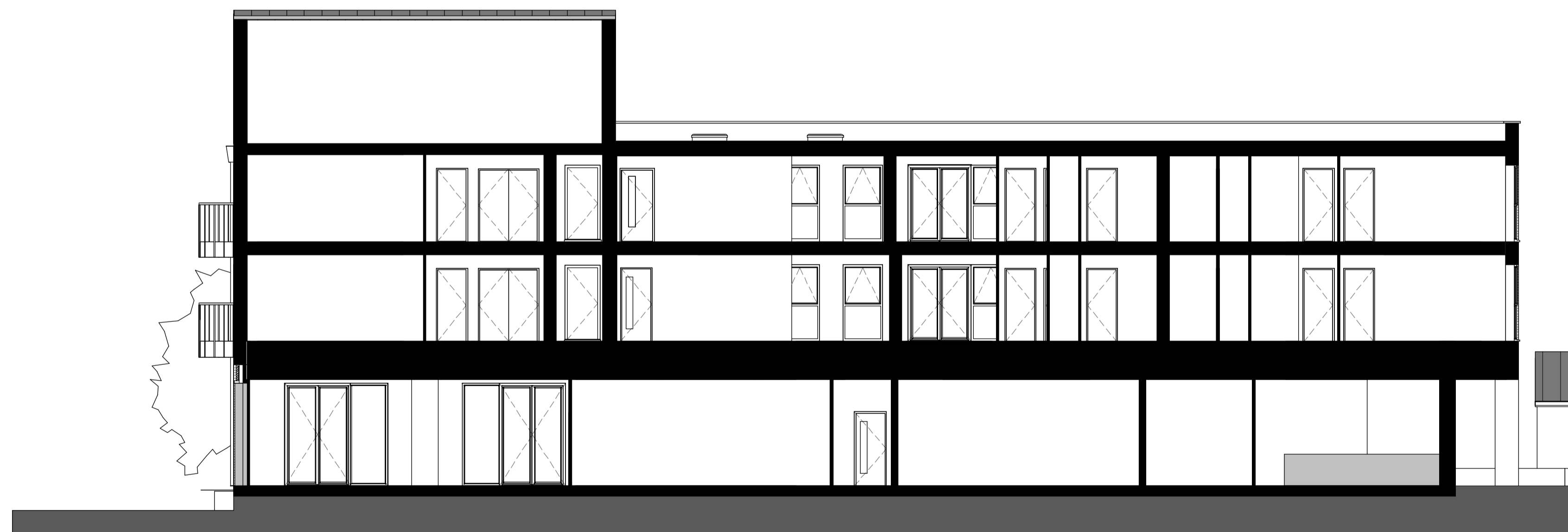
3 Section C-C 1 : 100