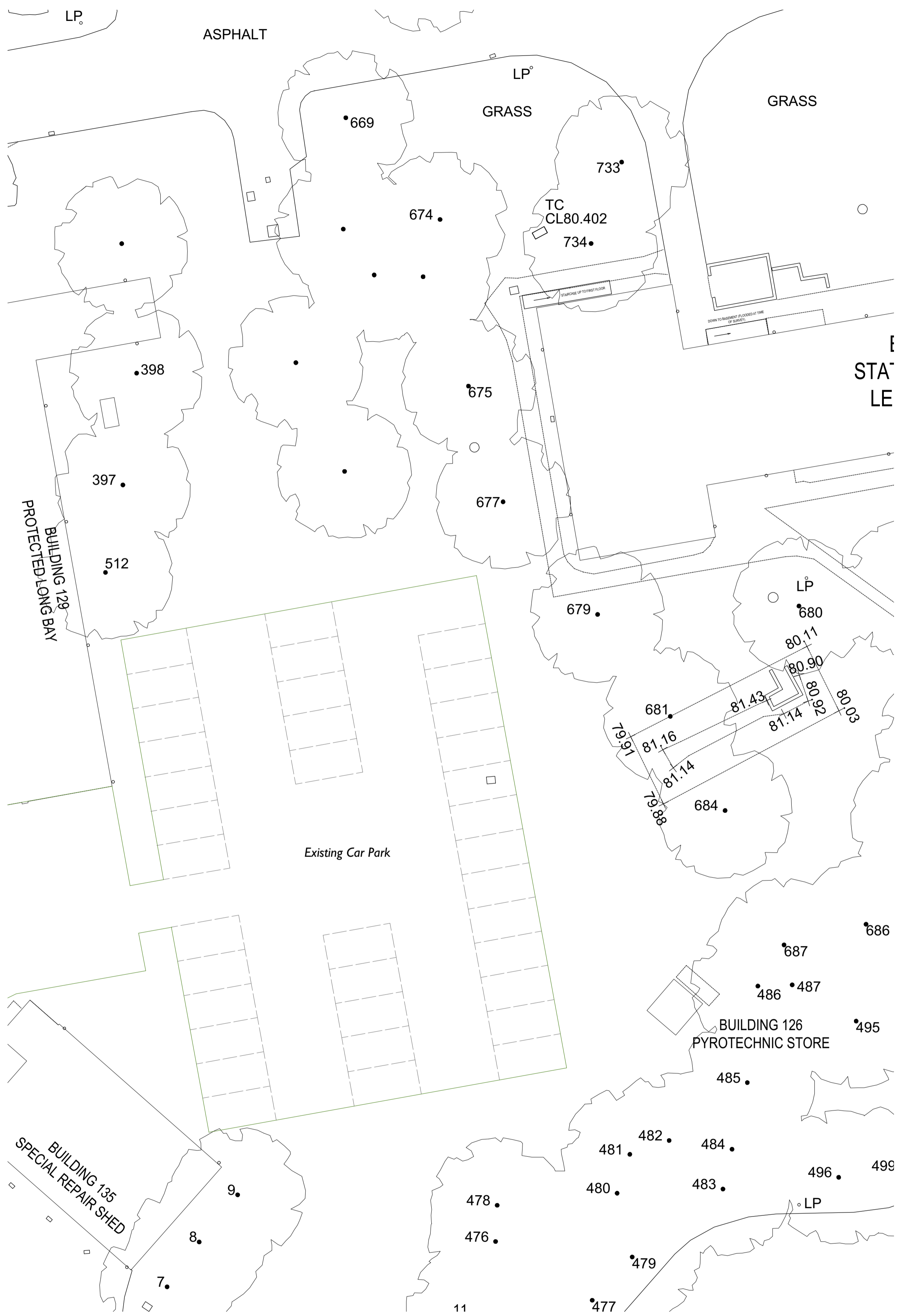
Existing Plan - 1:200 @ A1