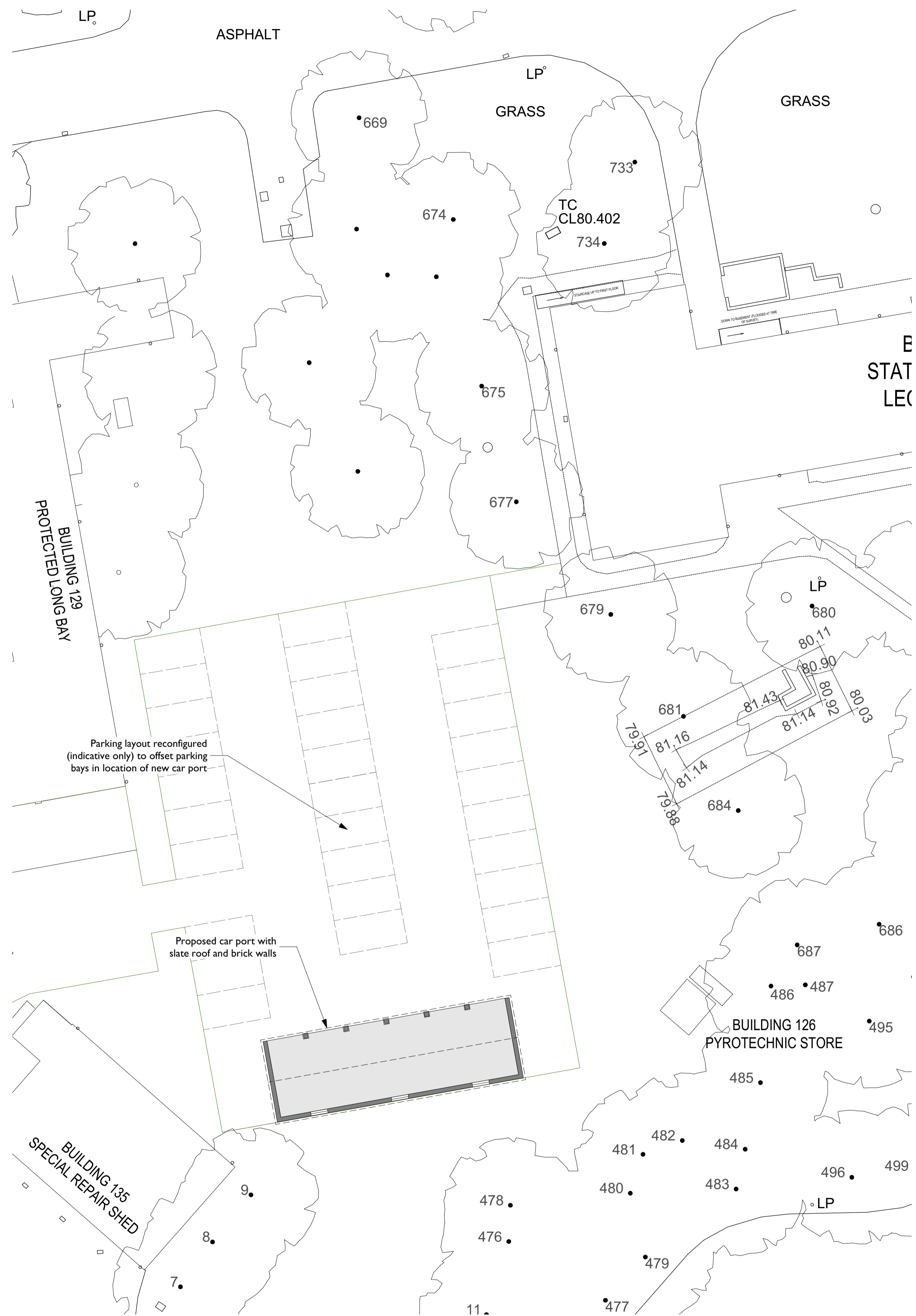
Proposed Plan - 1:200 @ A1