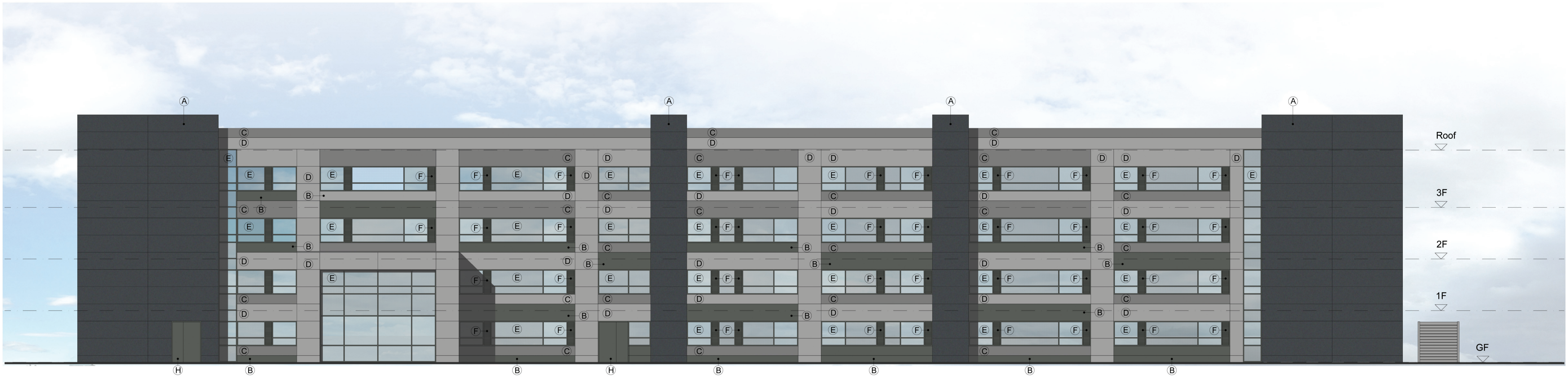
NORTH ELEVATION SCALE 1:100 @ A1