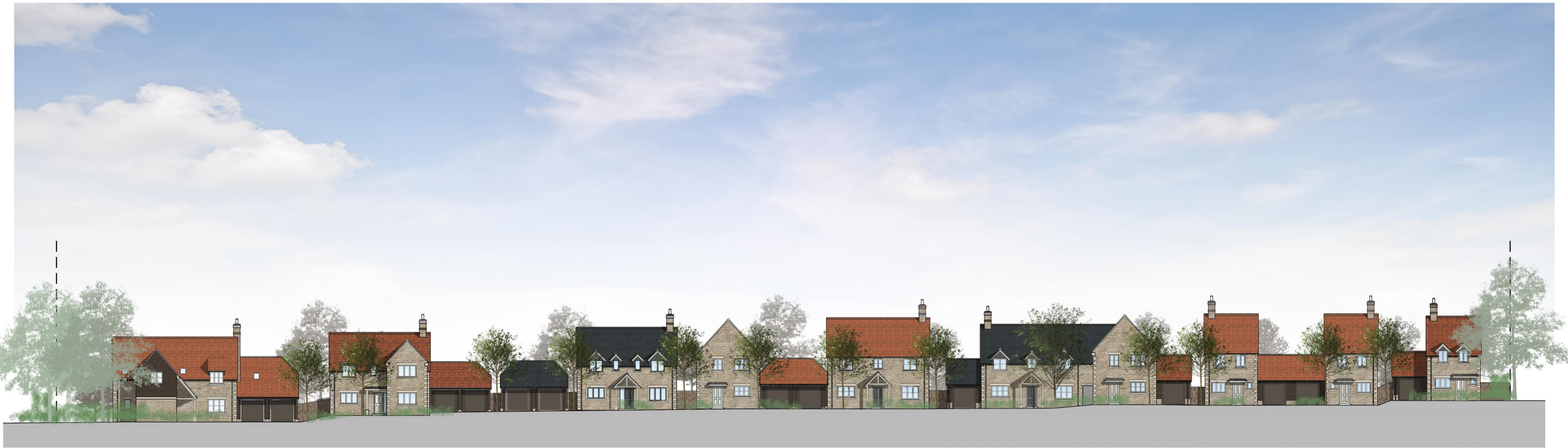
Street Scene from on site road