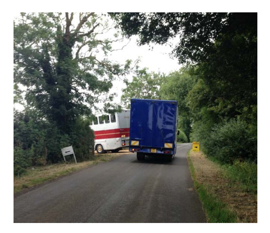
Photo 1 Lorries approaching from the east and using the new entrance in Main Road (no traffic management being used).