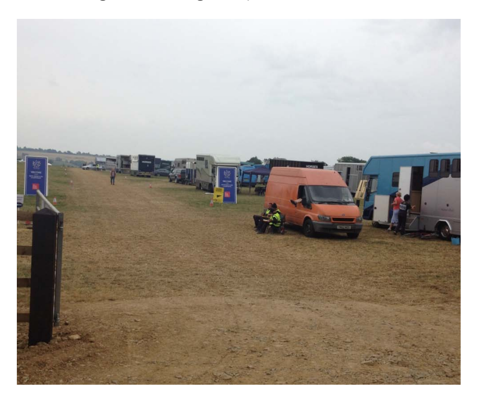
Photo 2 View into 28 day Event through new entrance in Main Road showing a large amount of vehicles attending Event

Photo 1 Lorries approaching from the east and using the new entrance in Main Road (no traffic management being used).