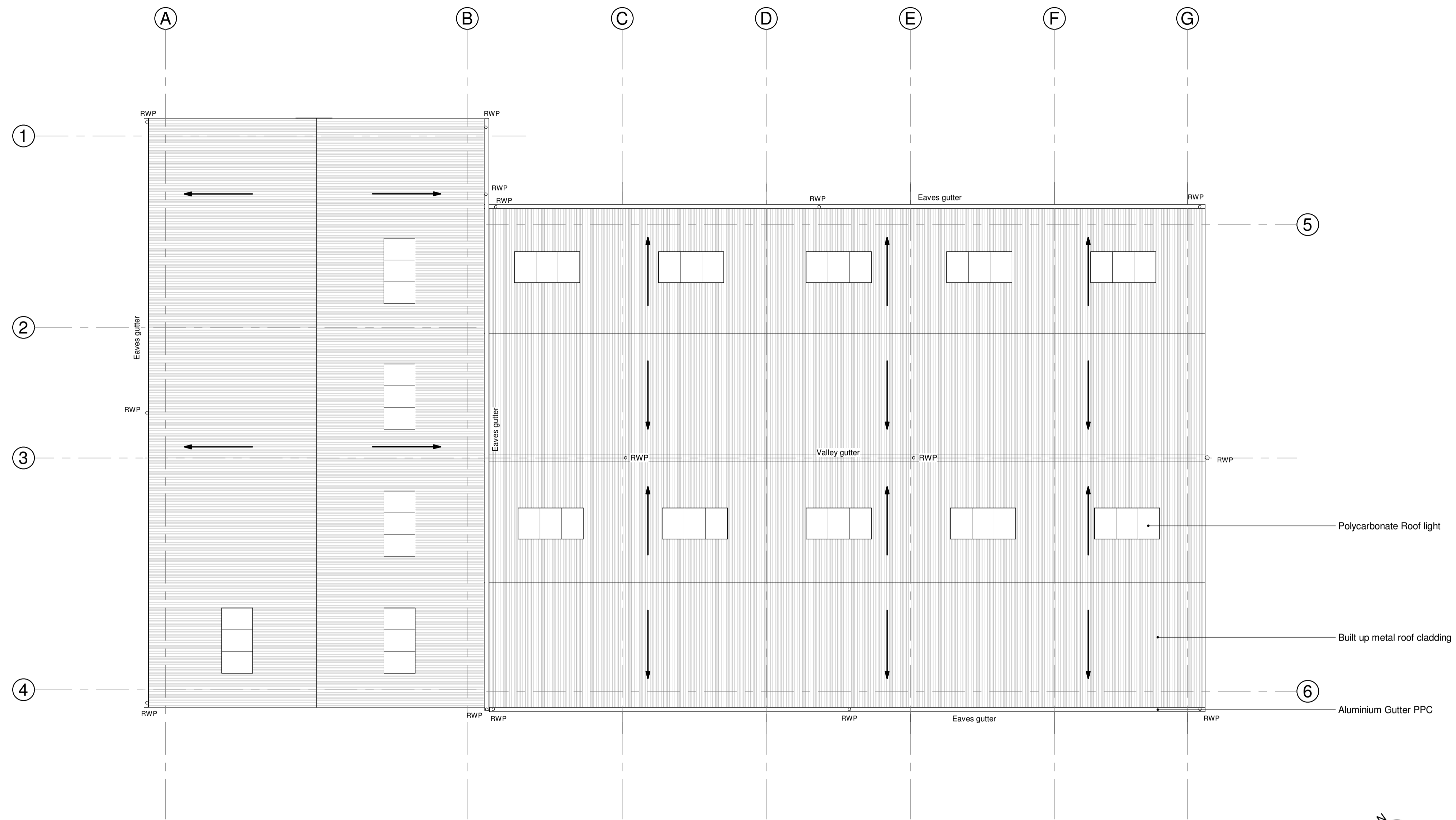
Roof Plan 1 : 100