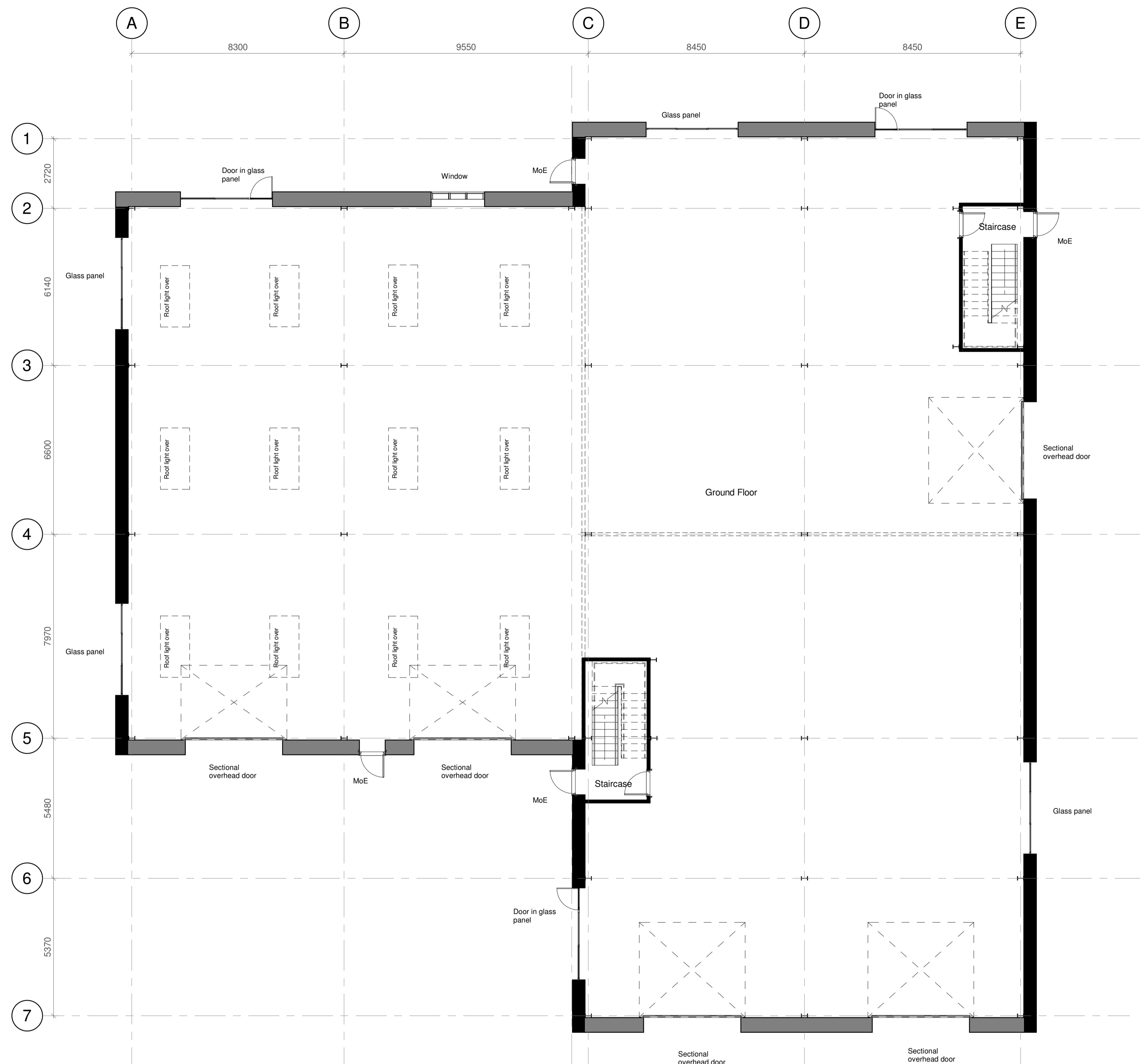
Ground Floor Plan 1 : 100