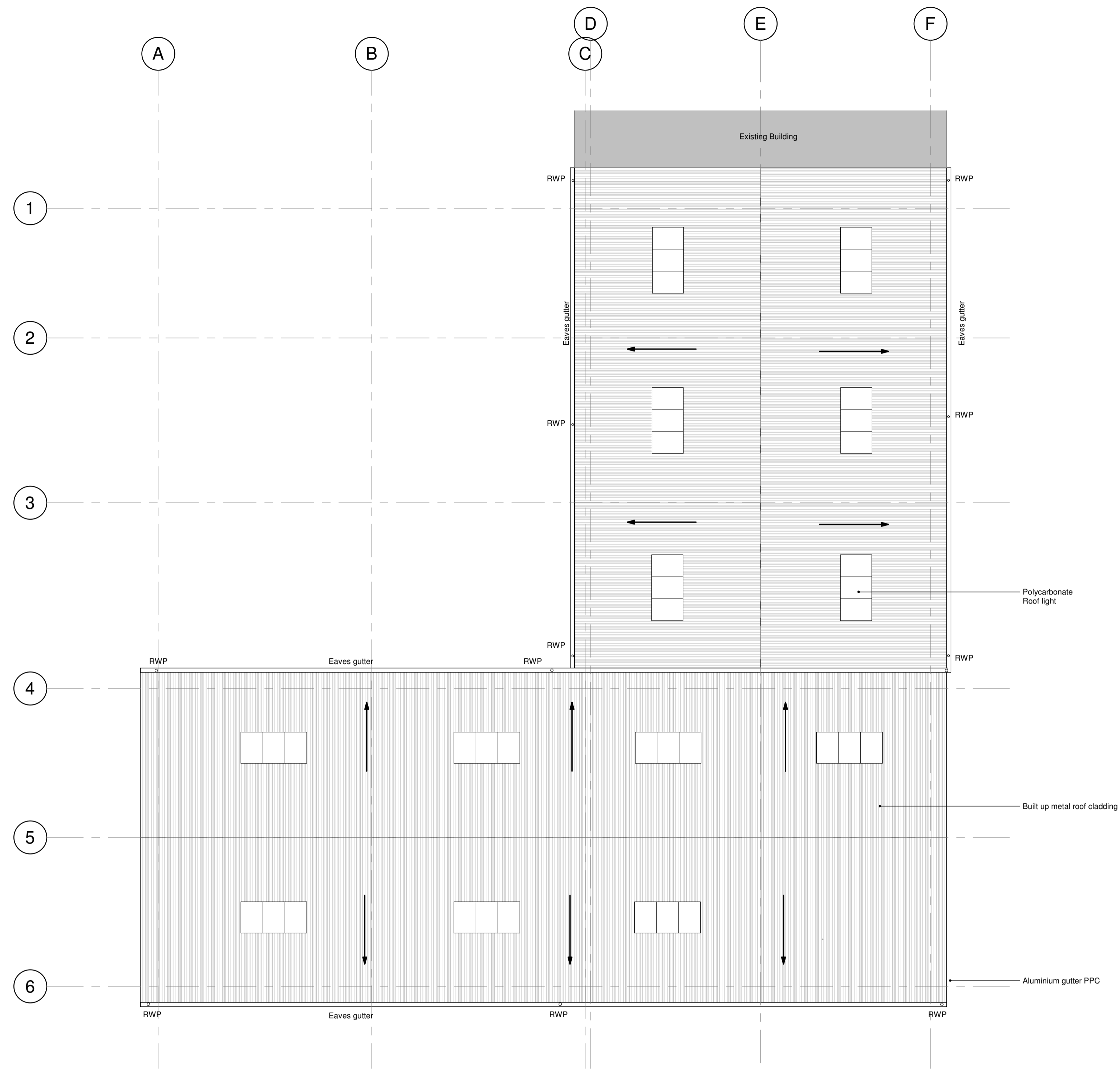
Roof Plan 1 : 100