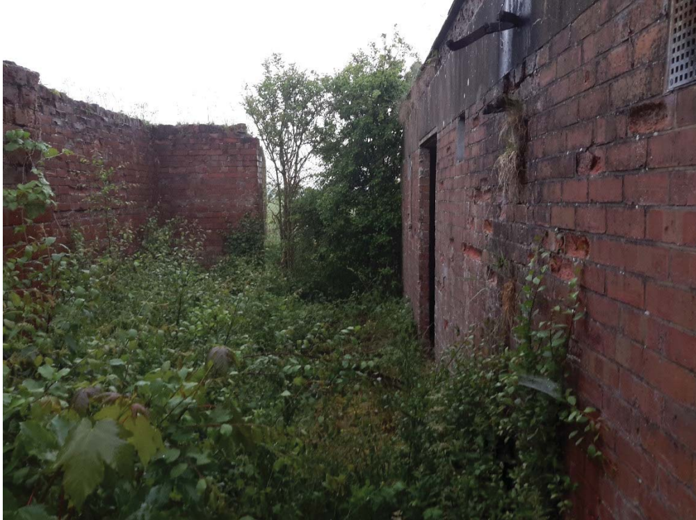
Plate 21 Blast Walls Within Former Ordnance Storage Area