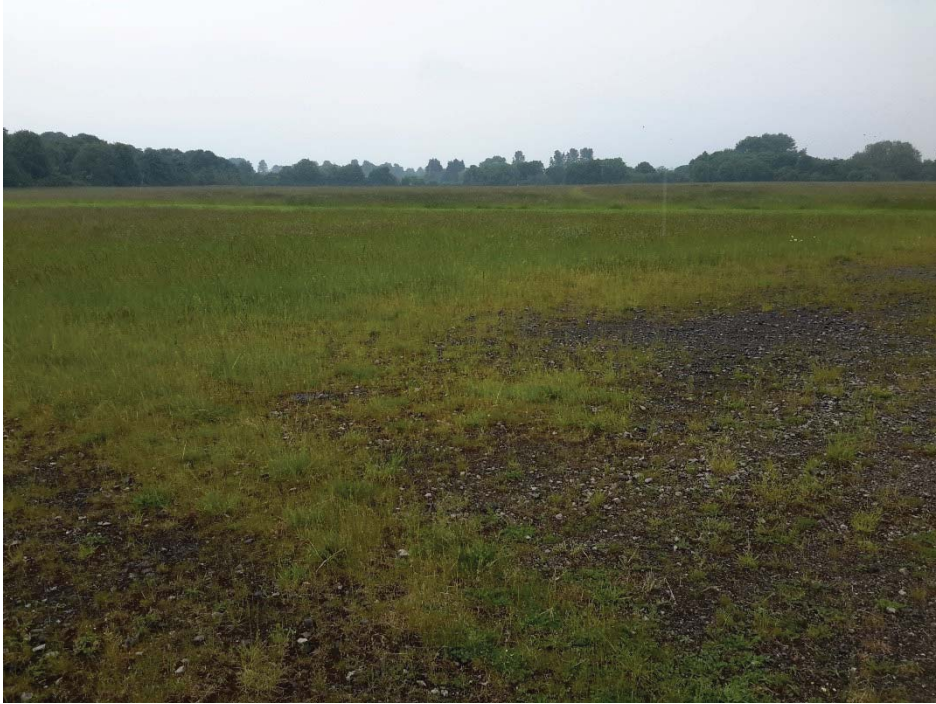
Plate 10 Grassland and Shrub Colonisation of Former Quarry