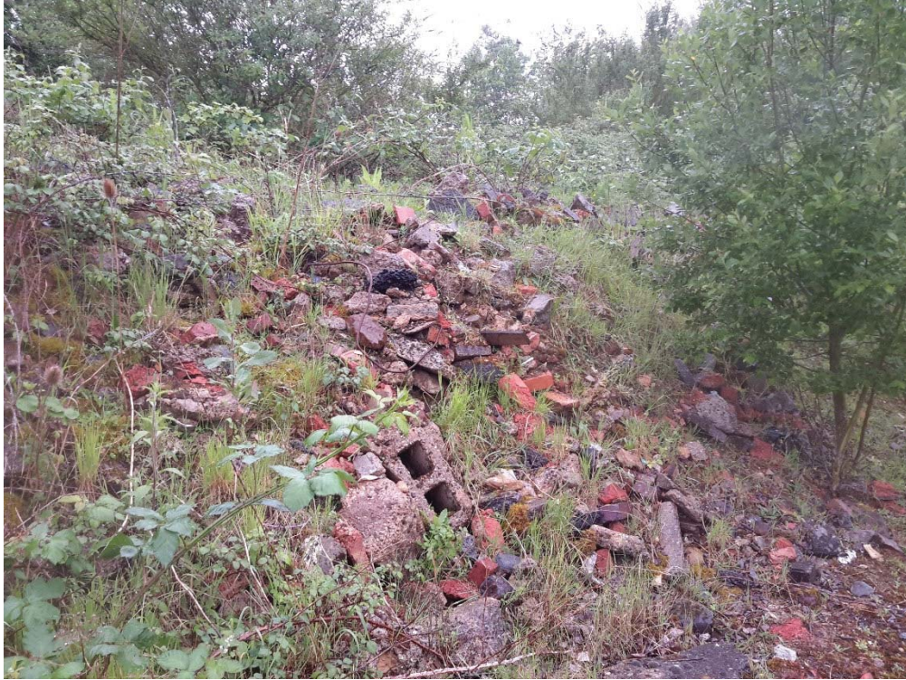
Plate 14 Waste Deposits in Former Quarry