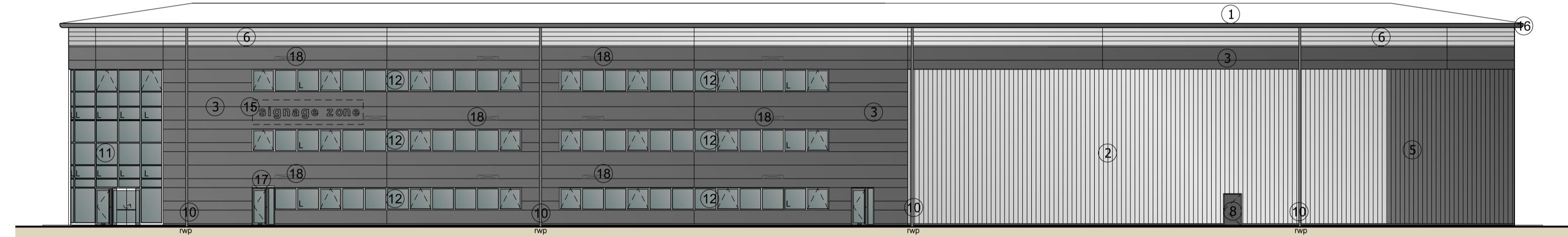
02 NORTH-WEST ELEVATION UNIT 1A