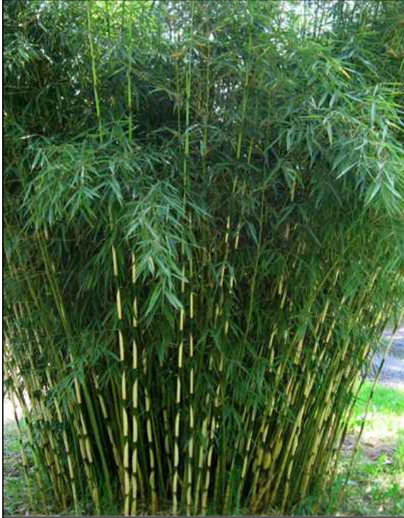
IMAGES, FROM TOP: Woodscape Modular Planter Systems: hardwood, in a range of sizes and heights, with and without seat tops Fargesia robusta : to be planted in planters as above