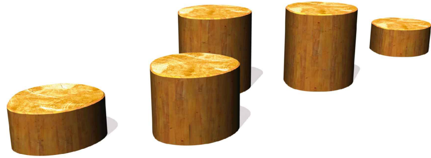
1. STEPPING LOGS Proludic, Origin Timber stepping logs (J4904).