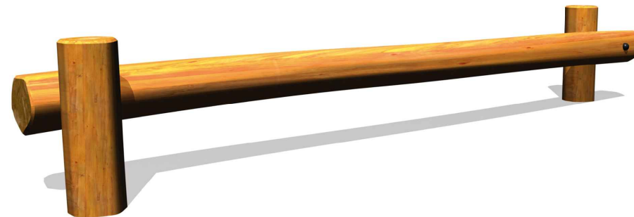
2. BALANCE BEAM Proludic, Origin Timber balance beam (J4901).