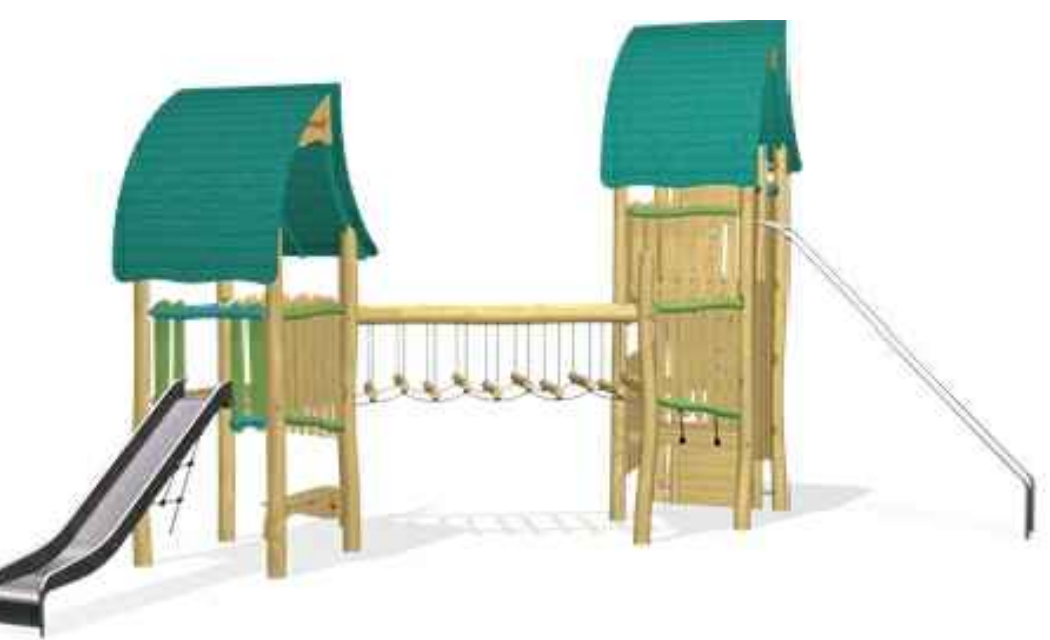
THE WIZARDS DOUBLE TOWER FORTRESS KOMPAN, Item NRO2005