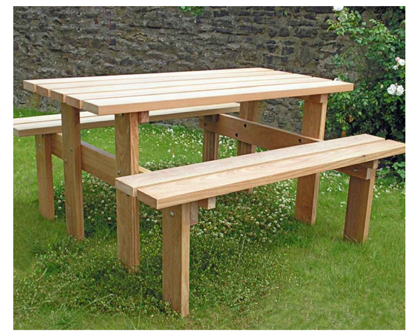
PICNIC BENCH Woodscape Cleveland Picnic Bench