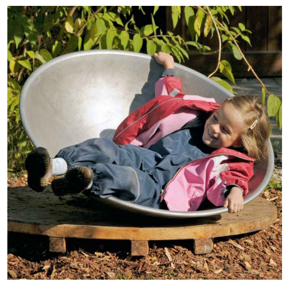
WOBBLE DISH Richter-Spielgeraete, Item 6.27300