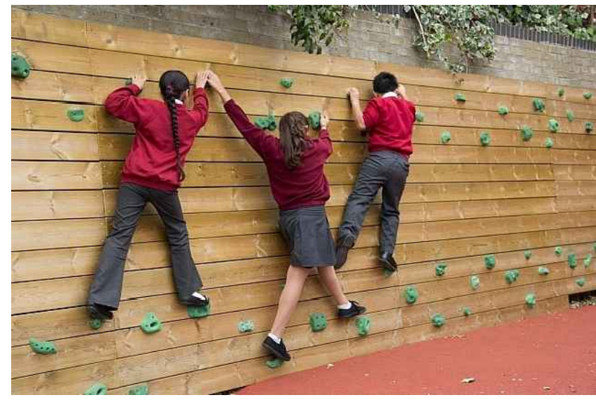
CLIMBING/KICK WALL 4no. Single sided Climbing Walls, Fawns, Item BWSGL