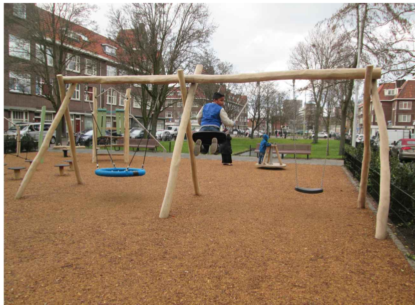
DOUBLE COMBINATION SWING KOMPAN, Item NRO907

Designation of the local division in the