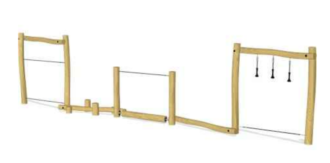
AGILITY TRAIL Agility Trail 1, KOMPAN, Item NRO860

Designation of the local division in the