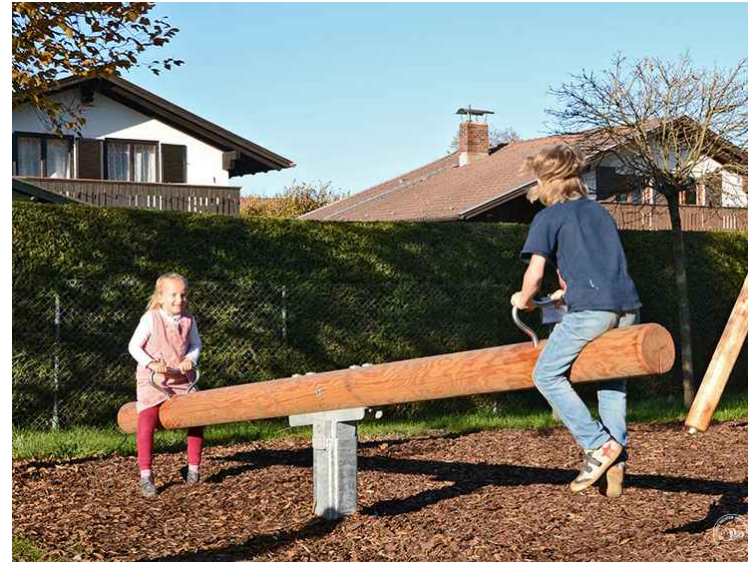
DOUBLE SWING Richter-Spielgeraete, Item 61280 with metal feet.