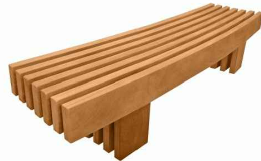
BENCH Woodscape Type 8 Curved Bench.