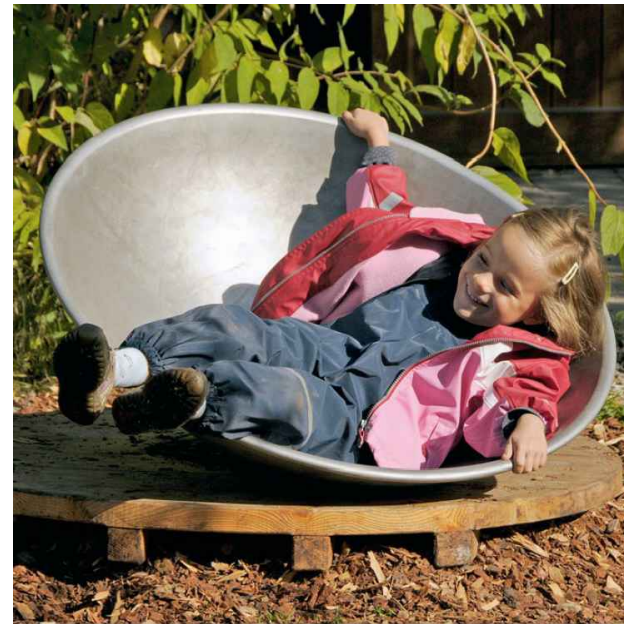
WOBBLE DISH Richter-Spielgeraete, Item 6.27300