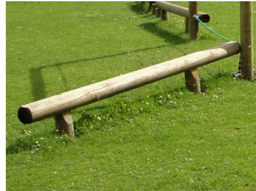
TIMBER BALANCE BEAMS