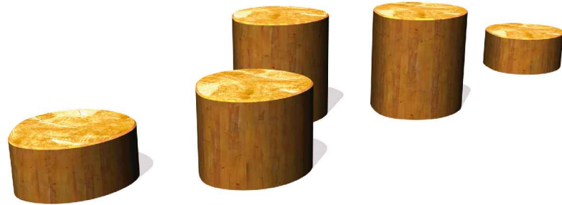
STEPPING LOGS Proludic, Origin Timber stepping logs (j4904)