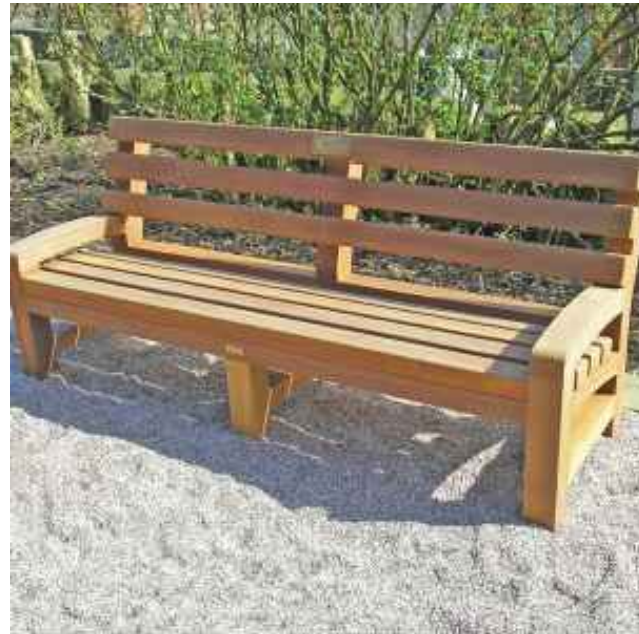
SEAT Woodscape Tooting Seat