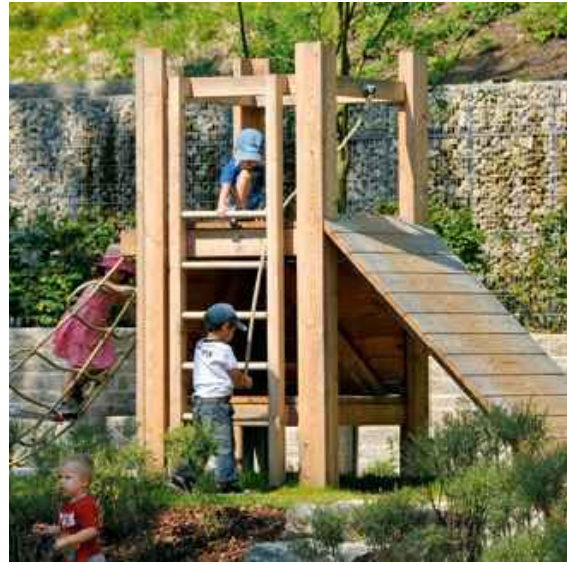
PLATFORM HUT WITH SLIDE Richter-Spielgeraete, Hut Combination 216, Item 2.12160 w/t roof - low w/t Roof - low 3.26800