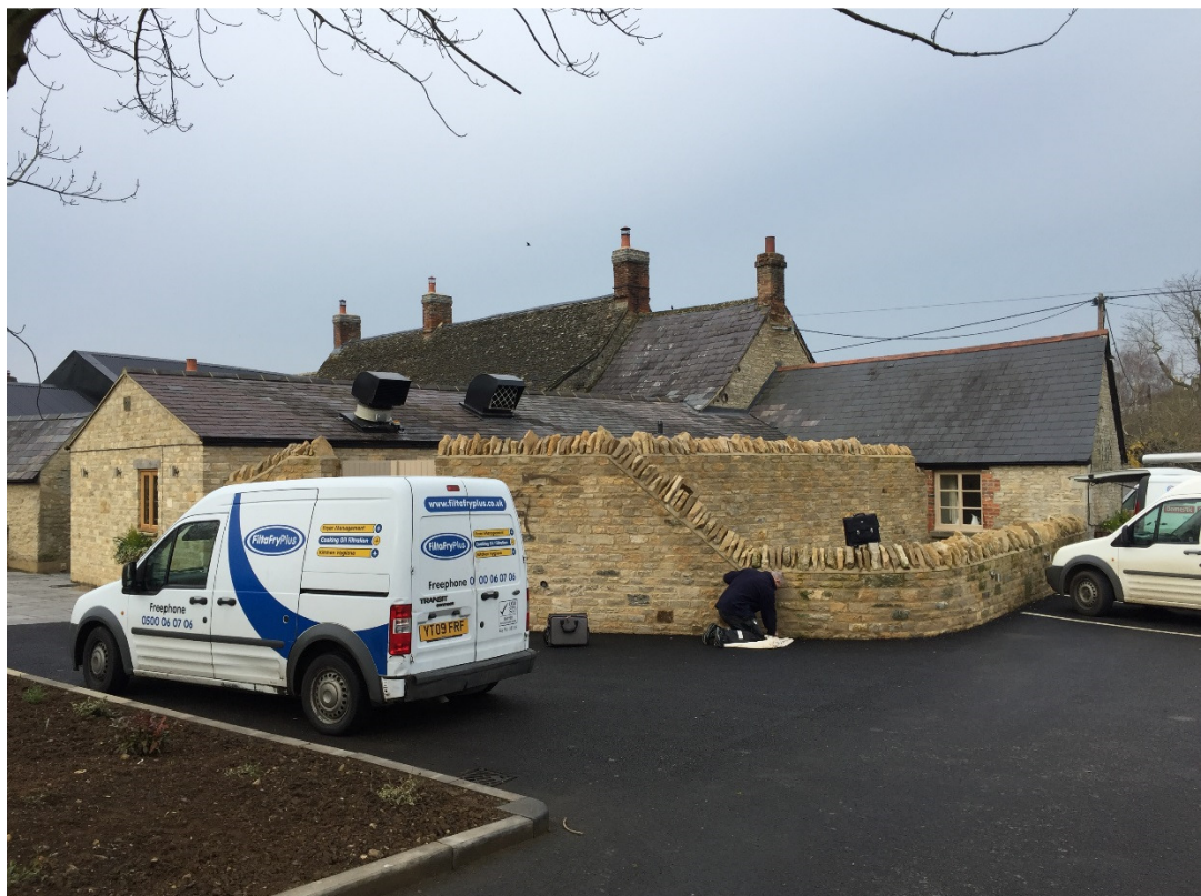
View of extractor hoods from the car park

The feedback received was that Neil has no comments to make on the extractor units, other than to suggest that they could have been designed better to allow the extractor to face upwards. However, no alternative product was proposed and therefore it is assumed that there may be no better alternative.