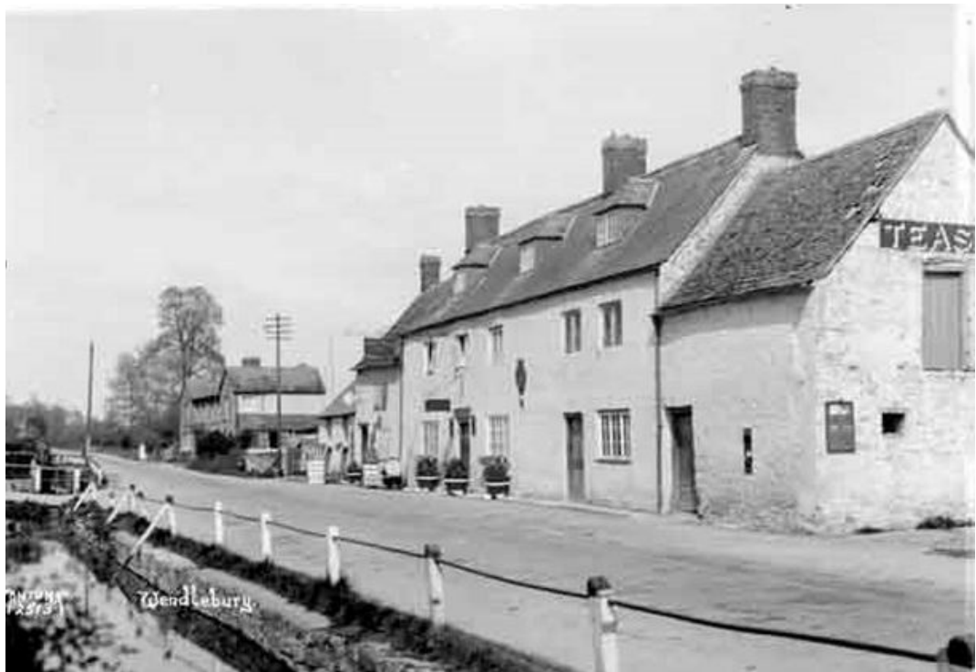
Historic photograph showing the Front Elevation in the early 1900s