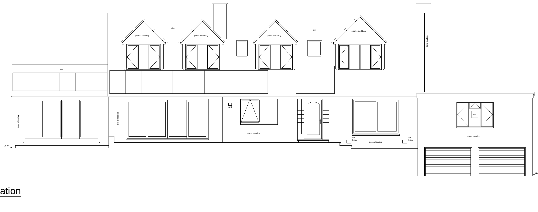
1 Existing South elevation Scale: 1:100