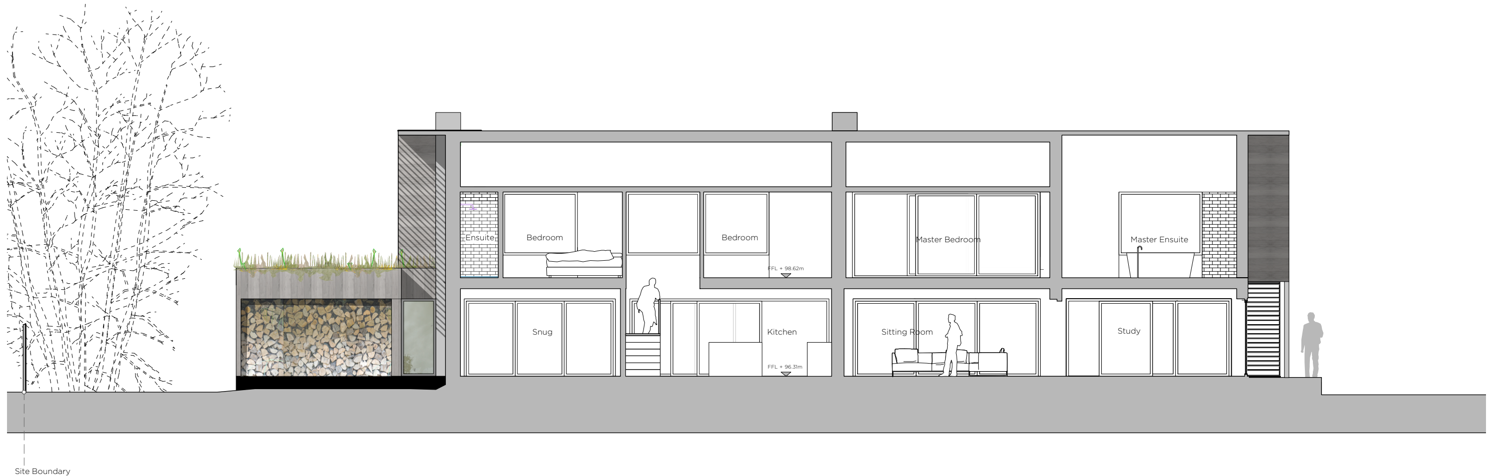
1 Proposed Section CC Scale: 1:100

Note: All levels and dimensions to be site surveyed and confirmed by the contractor. See also architectural details, mechanical and electrical intent layout and structural engineers drawings and specifications. Door and windows manufacturer to produce shop drawings for comment before manufacture. All details are intent only, to be finalised by the contractor. Drawings subject to statutory approvals.