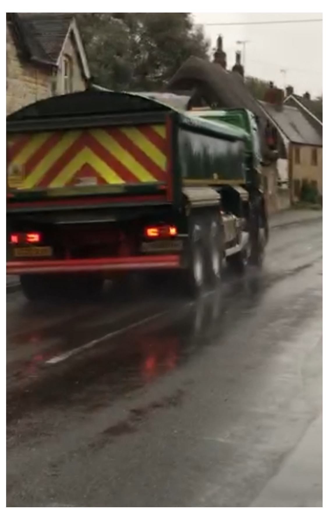
THIS LORRY IS ON THE WHITE LINES IN THE CENTRE OF THE ROAD. IF ANOTHER LORRY COMES THE OTHER WAY IT IS TIGHT TO SAY THE LEAST.