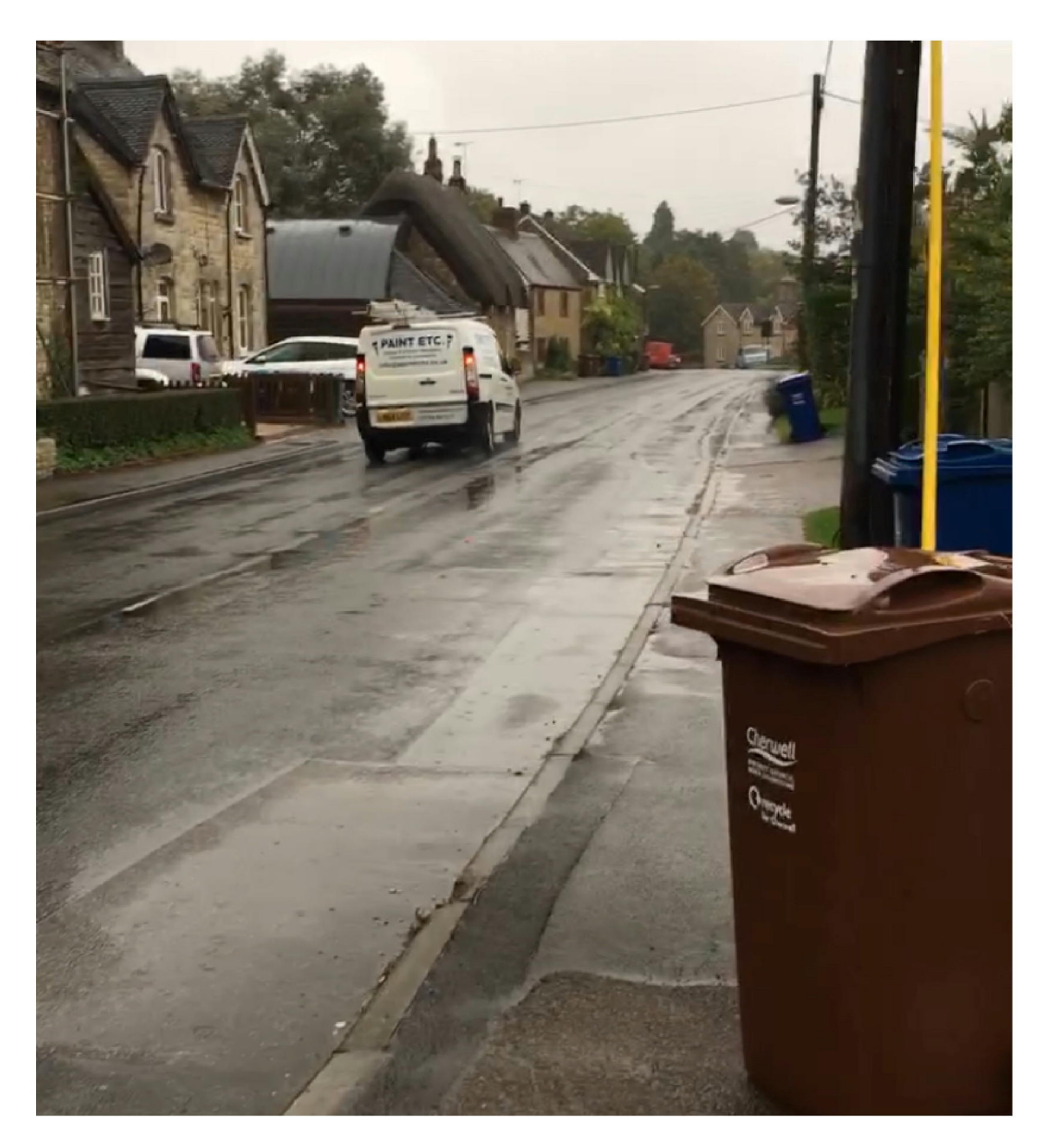
WHEN BIN COLLECTIONS OR DELIVERIES COME THROUGH THE VILLAGE IT MAKES THE PATH EVEN MORE NARROW AND THE TRAFFIC WILL CAUSE MORE CONGESTION.

we haven't included an image of how blind the corner is to go on to The Hale or how the HGV's take the corner wide in to on coming traffic, just to navigate that corner. But if the council needs to see them we can get those too.