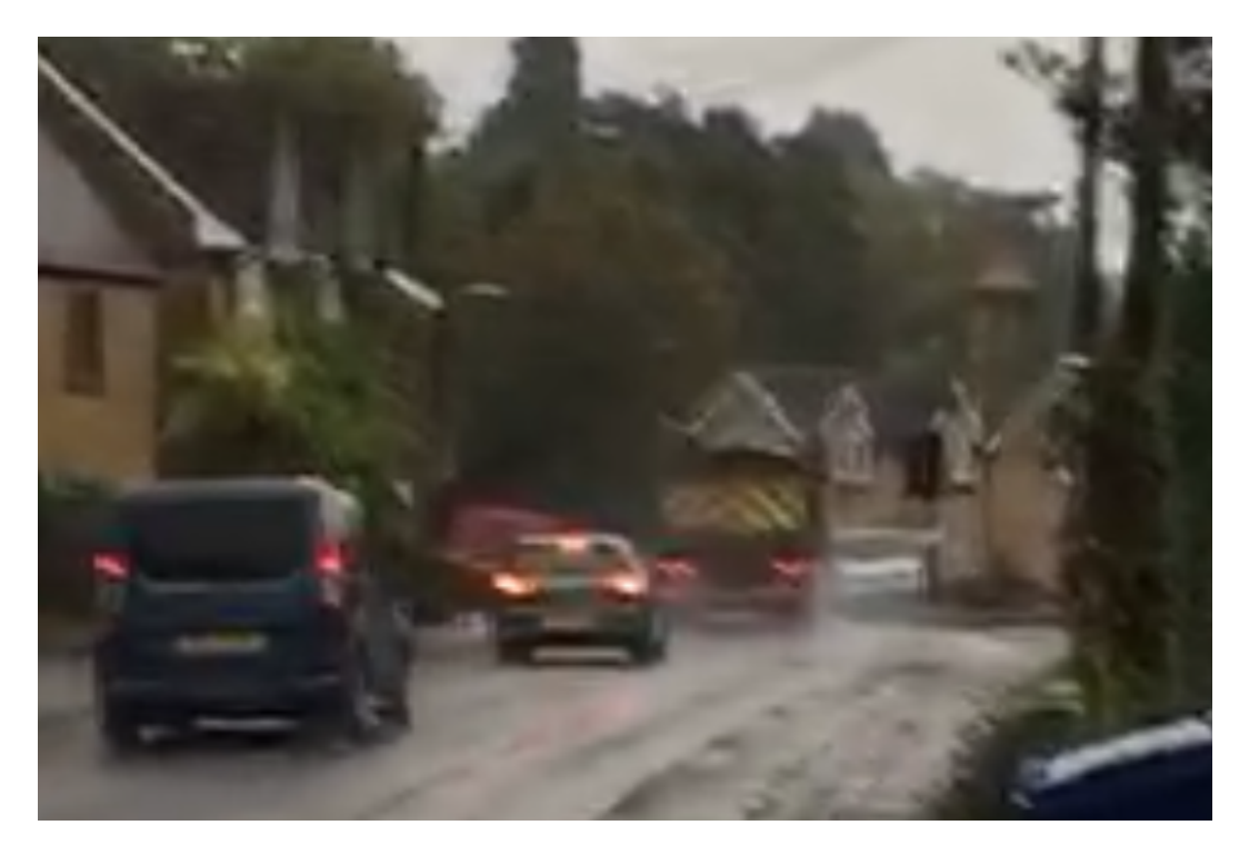
THE LORRY HAS TO GO ON THE OTHER SIDE OF THE ROAD TO OVER TAKE RESIDENTS VEHICLES. WHICH WILL STOP ON COMING TRAFFIC AND COULD AFFECT EMERGENCY VEHICLES.