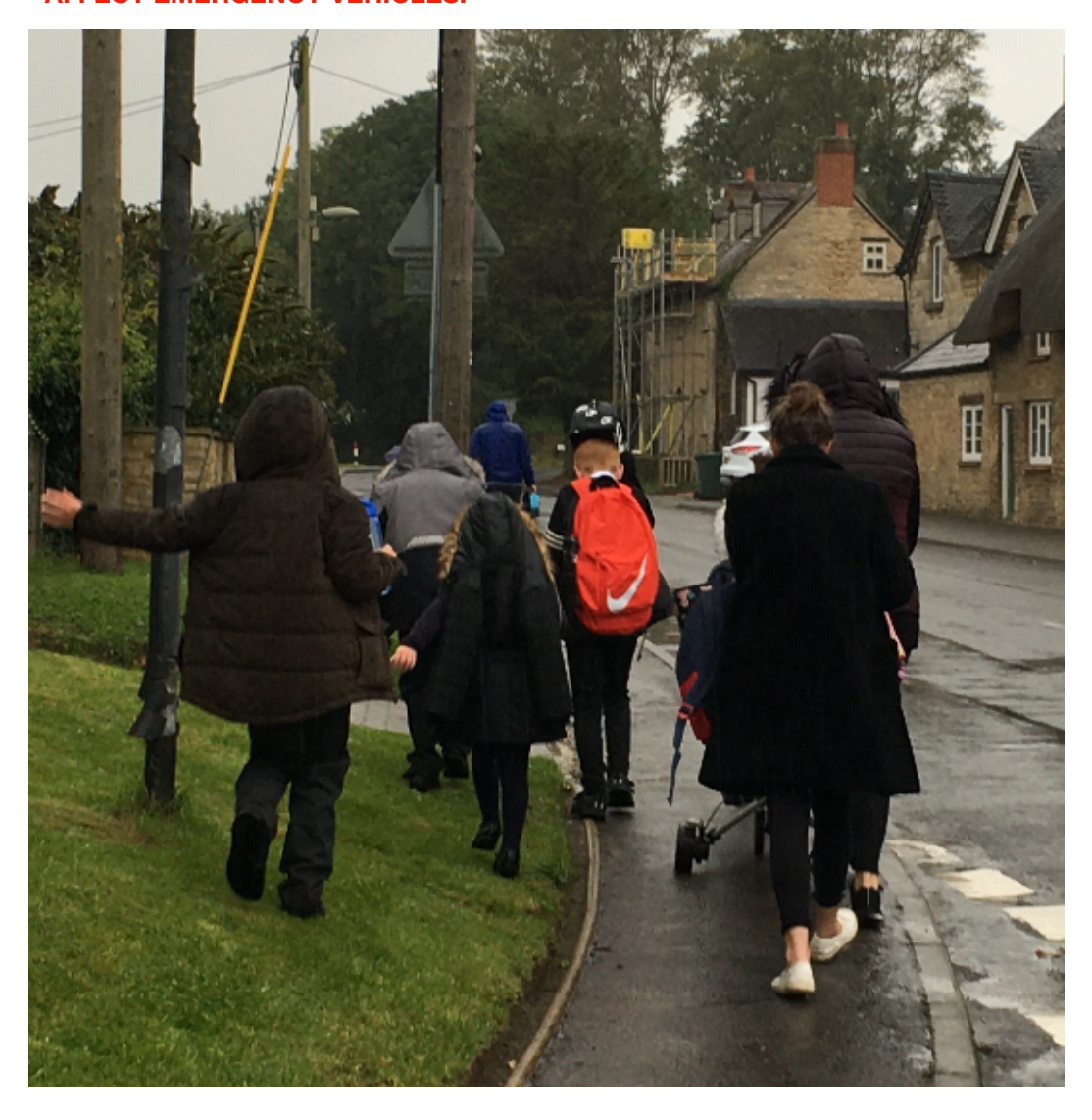
PATHS ARE NOT WIDE ENOUGH AND OFTEN MEANS PEOPLE HAVE TO WALK ON THE ROAD TO ABIDE THE 2 METER RULE