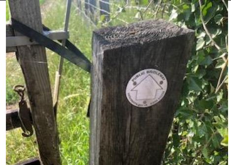
B430 Marked Bridleway, behind Armco