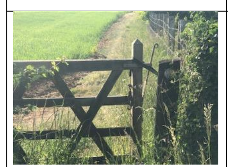
B430 Gate behind Armco