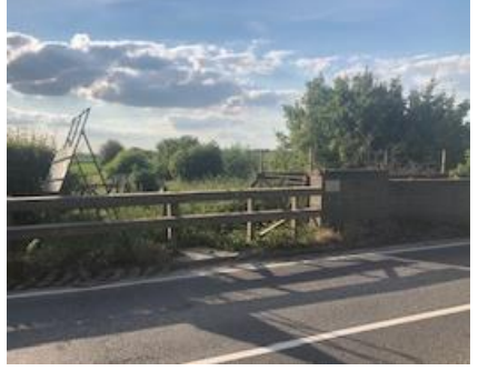
B430 View of Bridleway Entrance