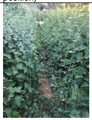
Bridleway in BBOWT Ardley