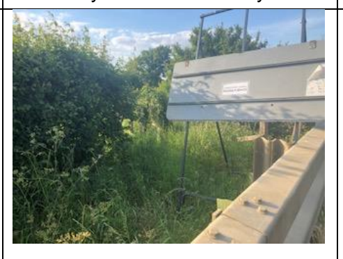
B430 Bridleway gate to left of sign