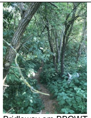
Bridleway om BBOWT Ardley