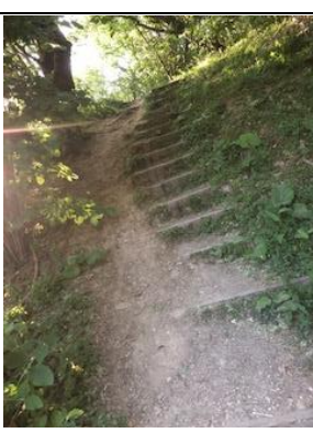
Bridleway in BBOWT Ardley