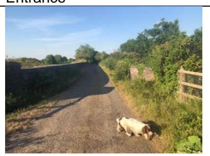
Suggested Alternative Bridge Crossing further north near Ardley "Earthworks" (see OS)