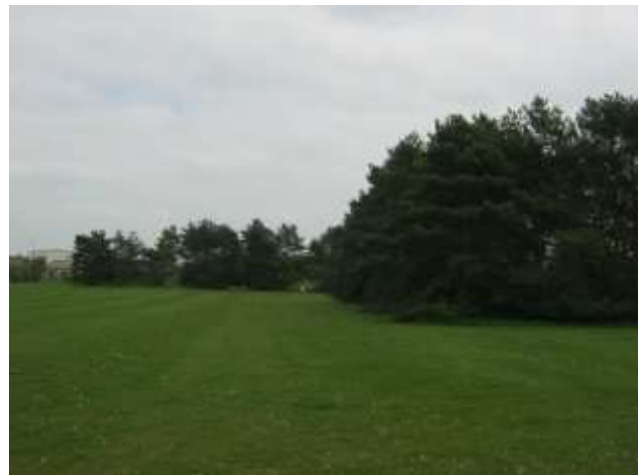
Photograph 4: Amenity grassland with conifer plantation in the south-west of the Application Site.