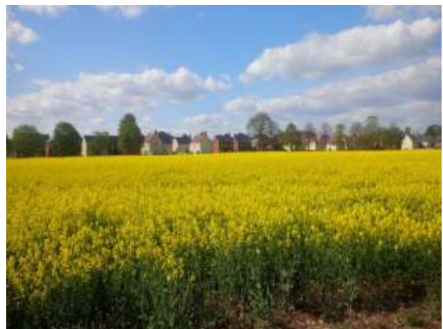
Photograph 6: Arable land in the south of the Application Site.