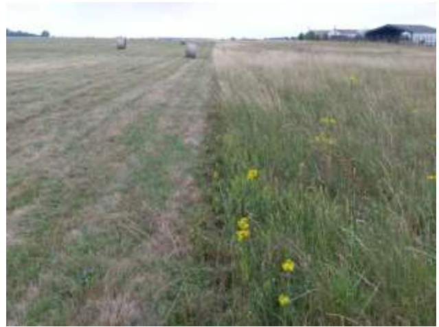
Photograph 2: Unimproved neutral grassland.