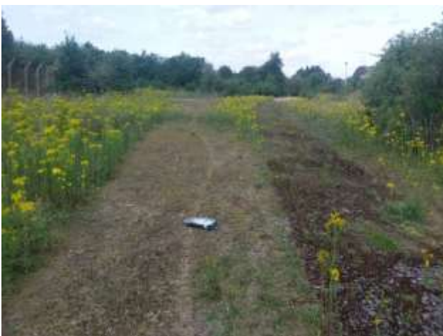
Photograph 5: Short ephemeral/ruderal vegetation in the east of the Application Site.