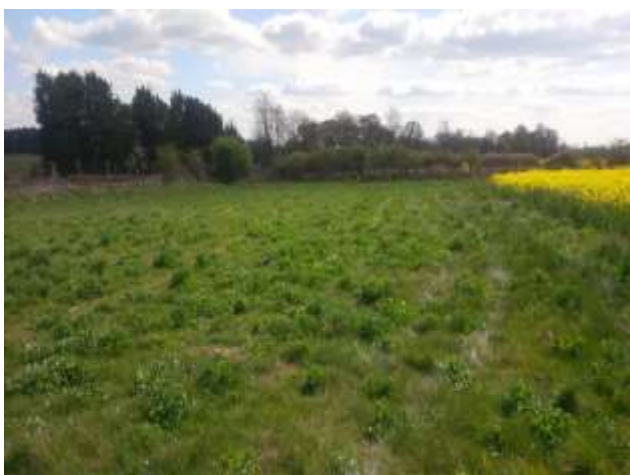
Photograph 7: Seeded arable margin in the west of the Application Site