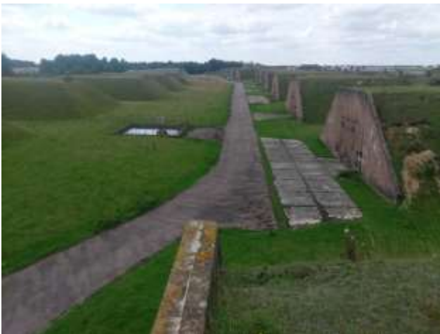
Photograph 3: Unimproved and semi-improved calcaerous grassland in the Southern Bomb Store. Light brown areas are unimproved calcaerous.