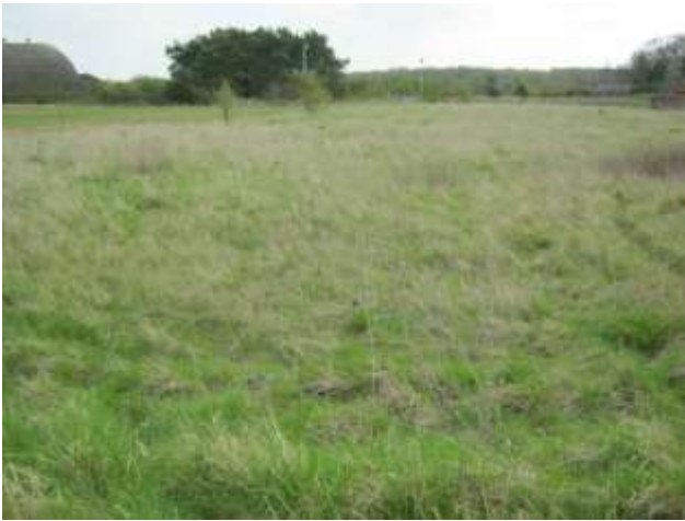
Photograph 1: Poor semi-improved grassland.