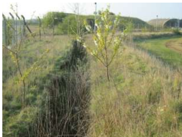
Photograph 8: Dry ditch in the east of the Application Site.