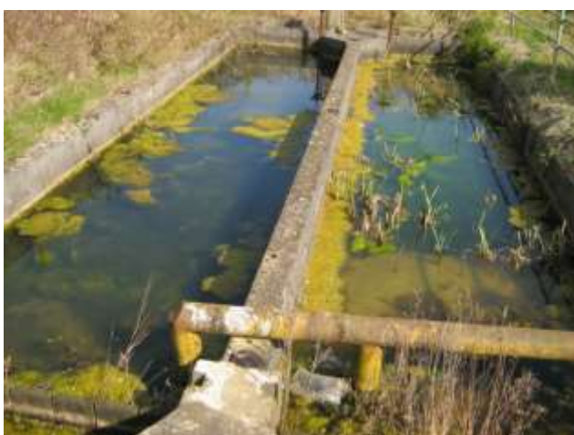
Photograph 9: Typical on site waterbody