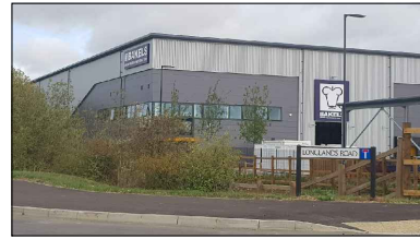
EXISTING SIGN 1 AND 3