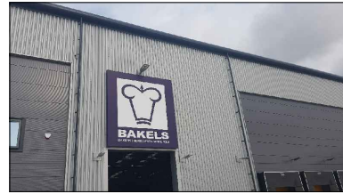
EXISTING SIGN 1 AND 2