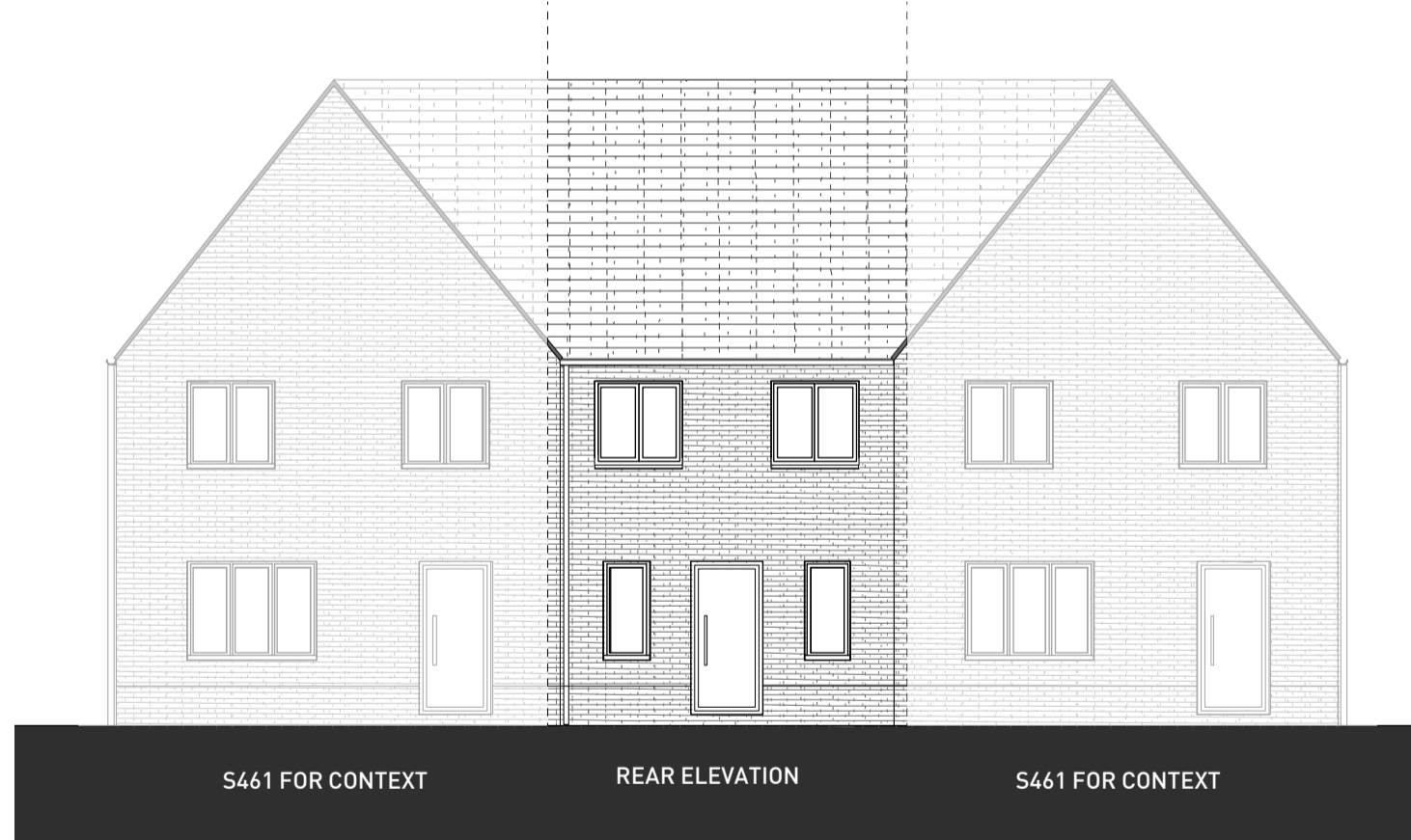
S461 FOR CONTEXT REAR ELEVATION S461 FOR CONTEXT