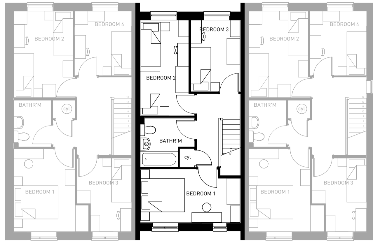
S461 FOR CONTEXT FIRST FLOOR S461 FOR CONTEXT

Copyright Pegasus Planning Group Ltd. Crown copyright. All rights reserved. Ordnance Survey Copyright Licence number 10002076. Promap Licence number 10002046. EmuSite Licence number 00003675. Standard OS licence rights conditions apply. Pegasus accepts no liability for any use of this document other than for its original purpose, or by the original client, or following Pegasus' explicit agreement to do so. 10/2017 04/17/17 www.pegasuspg.co.uk