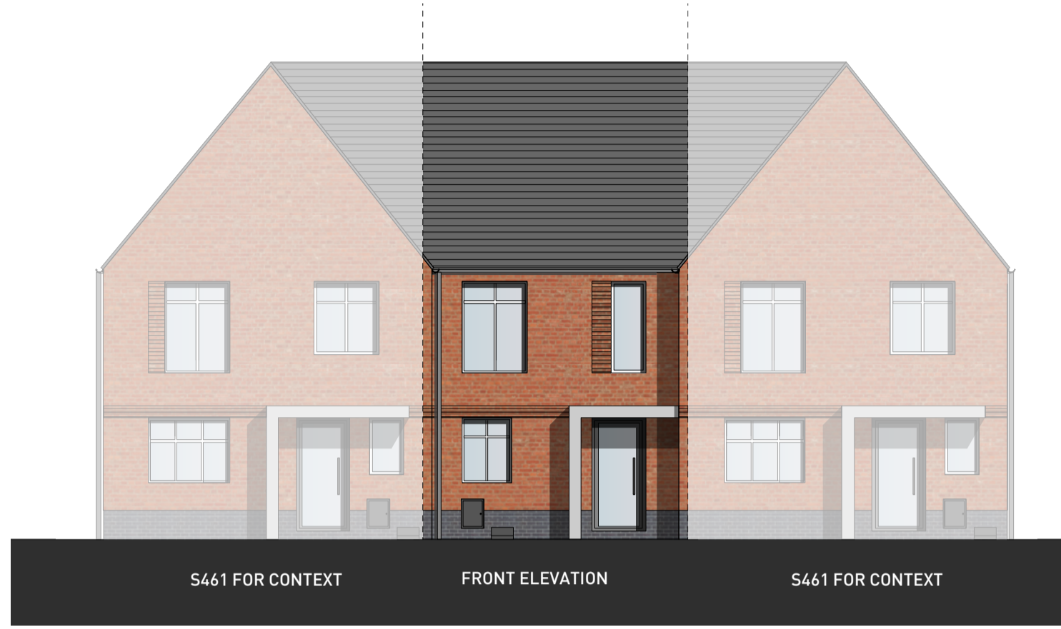
S461 FOR CONTEXT FRONT ELEVATION S461 FOR CONTEXT