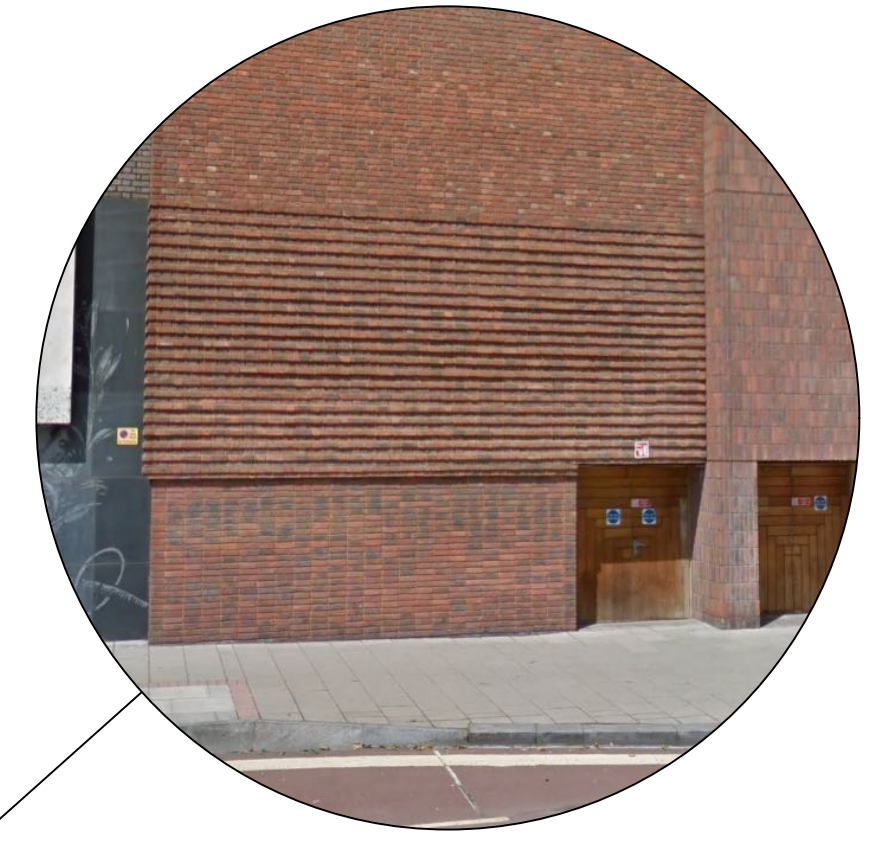
DECORATIVE BRICK DETAIL COURSE

Copyright Pegasus Planning Group Ltd. Crown copyright. All rights reserved. Ordnance Survey Copyright Licence number 100042893. Promap. Licence number 100026449. EnagSite. Licence number 0100031423. Standard OS licence rights conditions apply. Pegasus accepts no liability for any use of this document other than for its original purpose, or by the original client, or following Pegasus' express agreement to such use. T 01235 441717 www.pegasuspg.co.uk