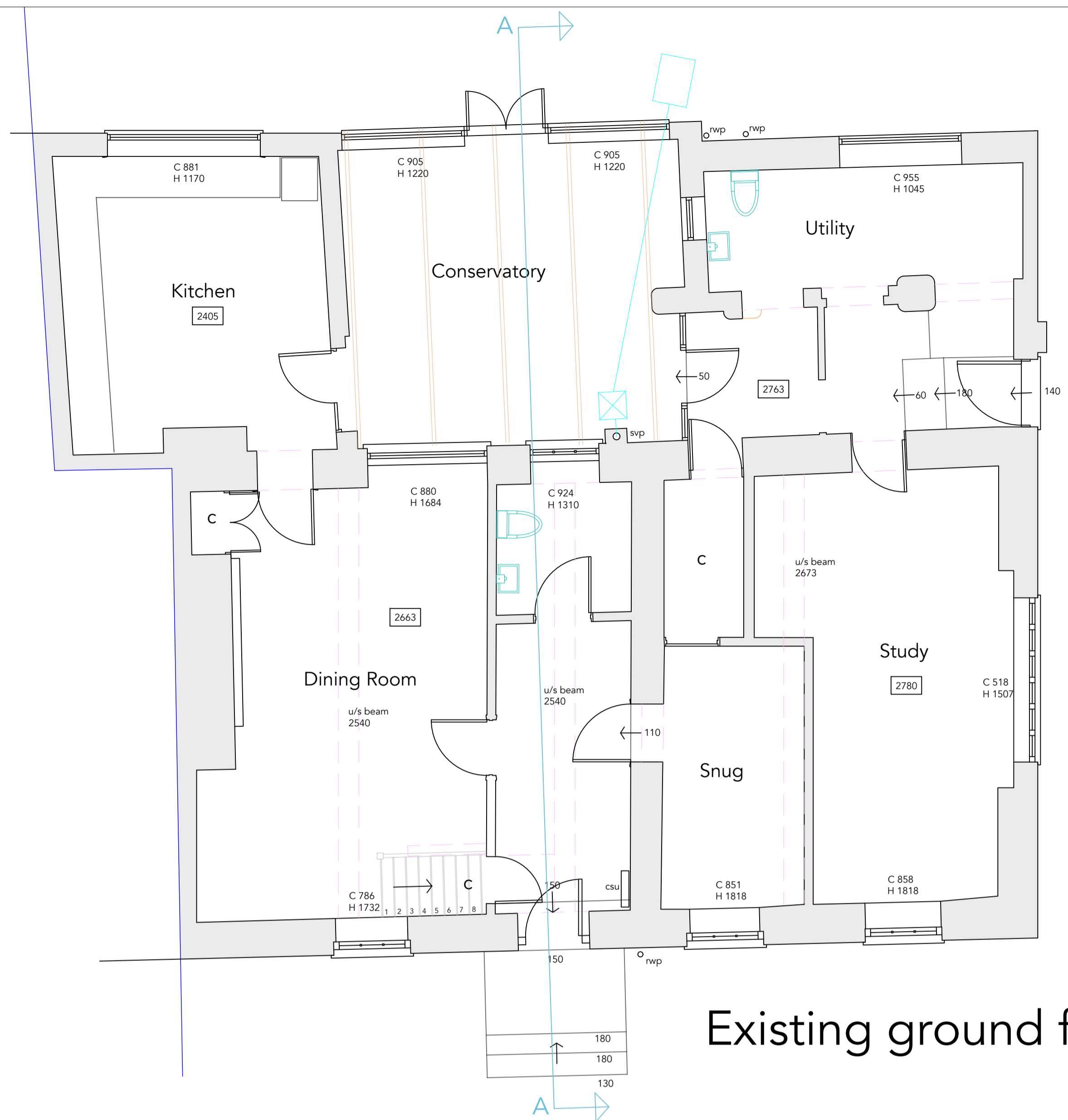
Existing ground floor 1:50