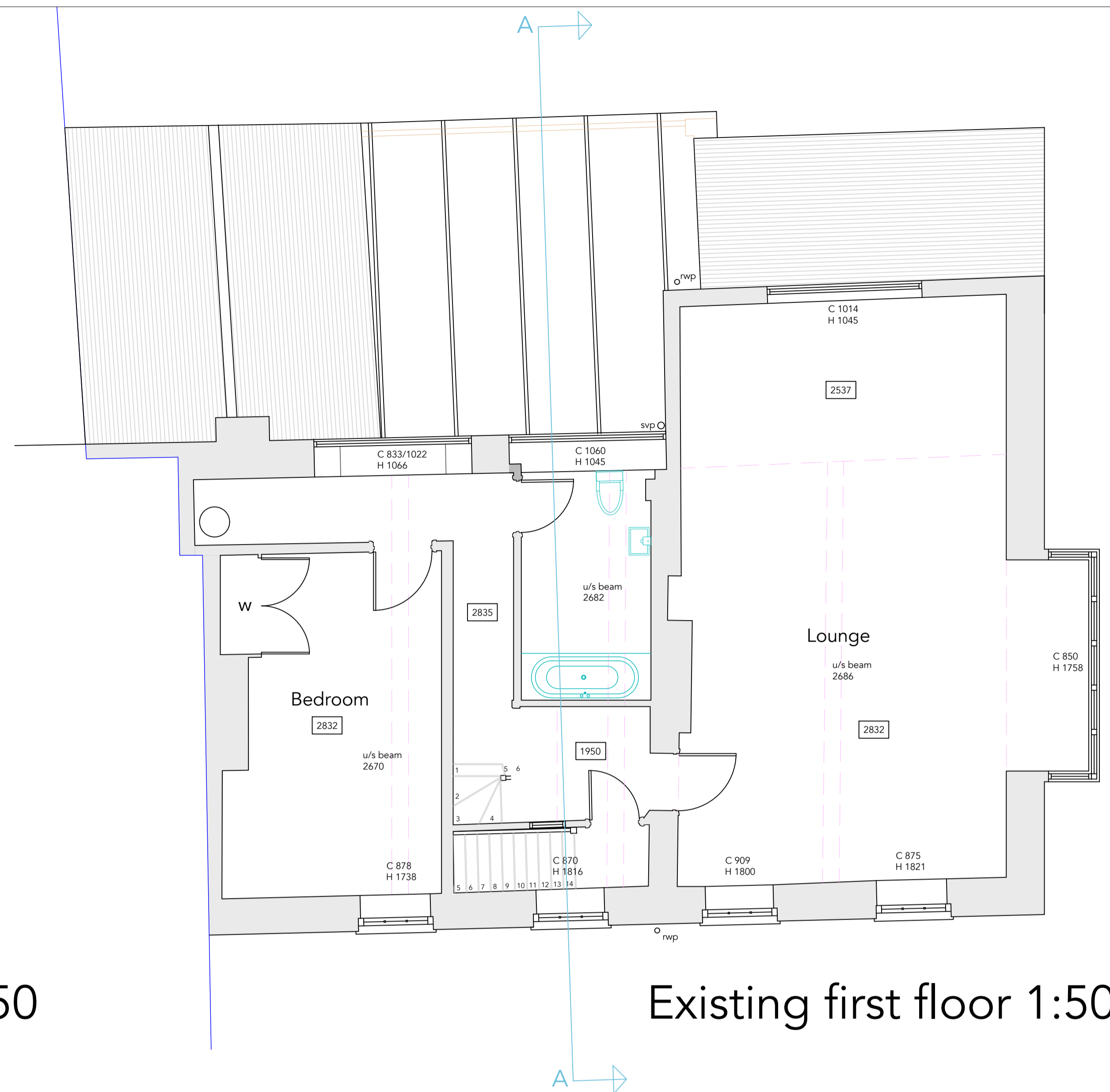
Existing first floor 1:50