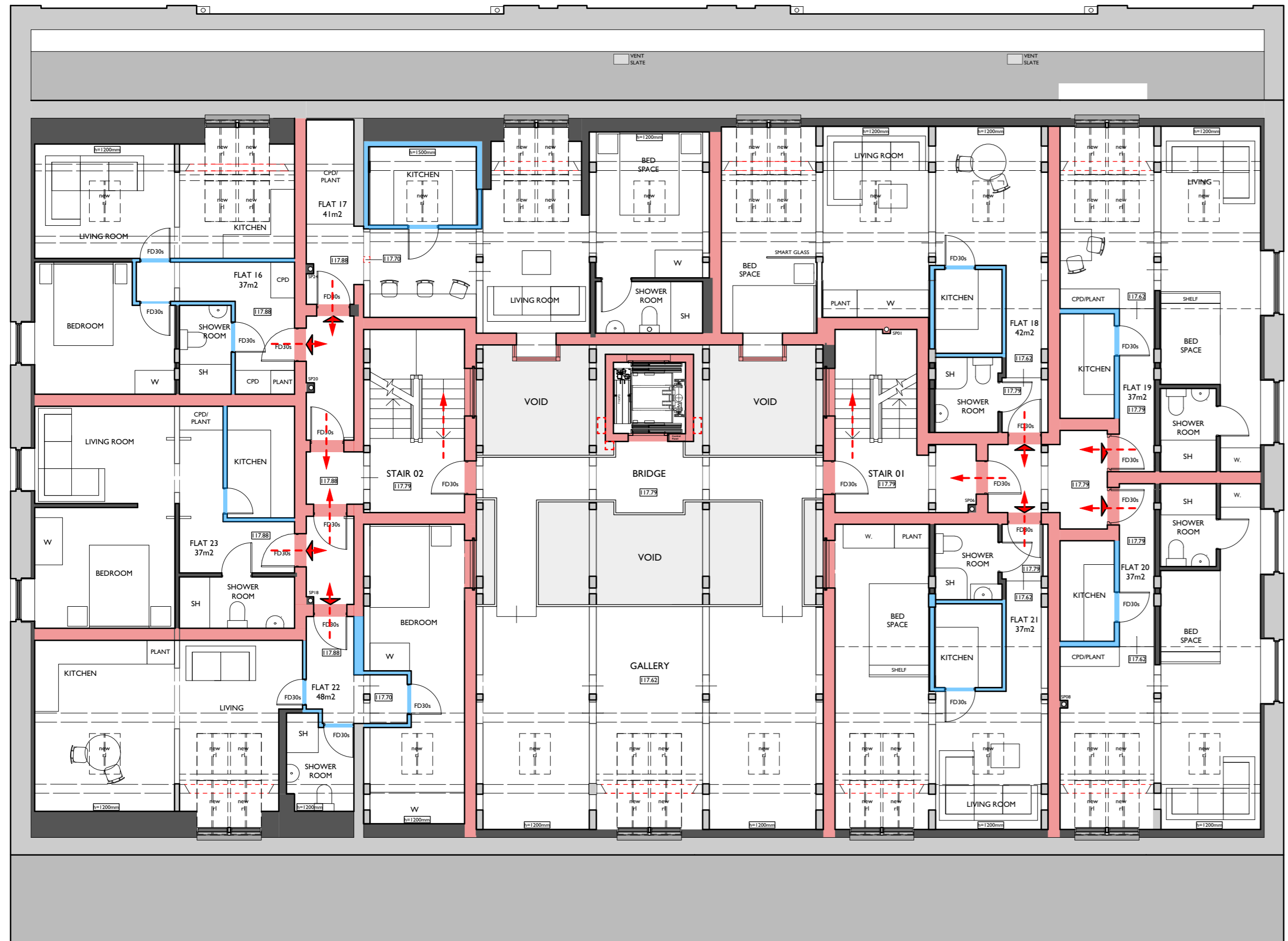
PROPOSED SECOND FLOOR