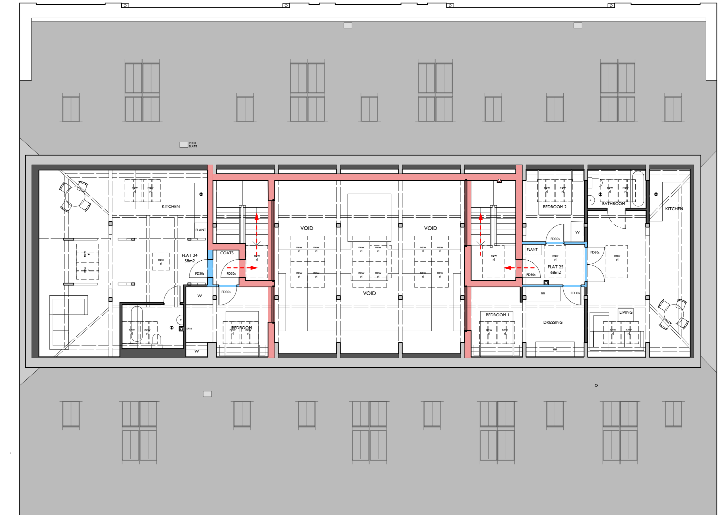
PROPOSED THIRD FLOOR

DO NOT SCALE THIS DRAWING USE DIMENSIONS ONLY VERIFY ALL DIMENSIONS ON SITE BEFORE COMMENCING ANY WORK OR SHOP DRAWINGS INFORM THE ARCHITECT BEFORE ANY WORK STARTS IF THIS DRAWING EXCEEDS THE QUANTITIES IN ANY WAY