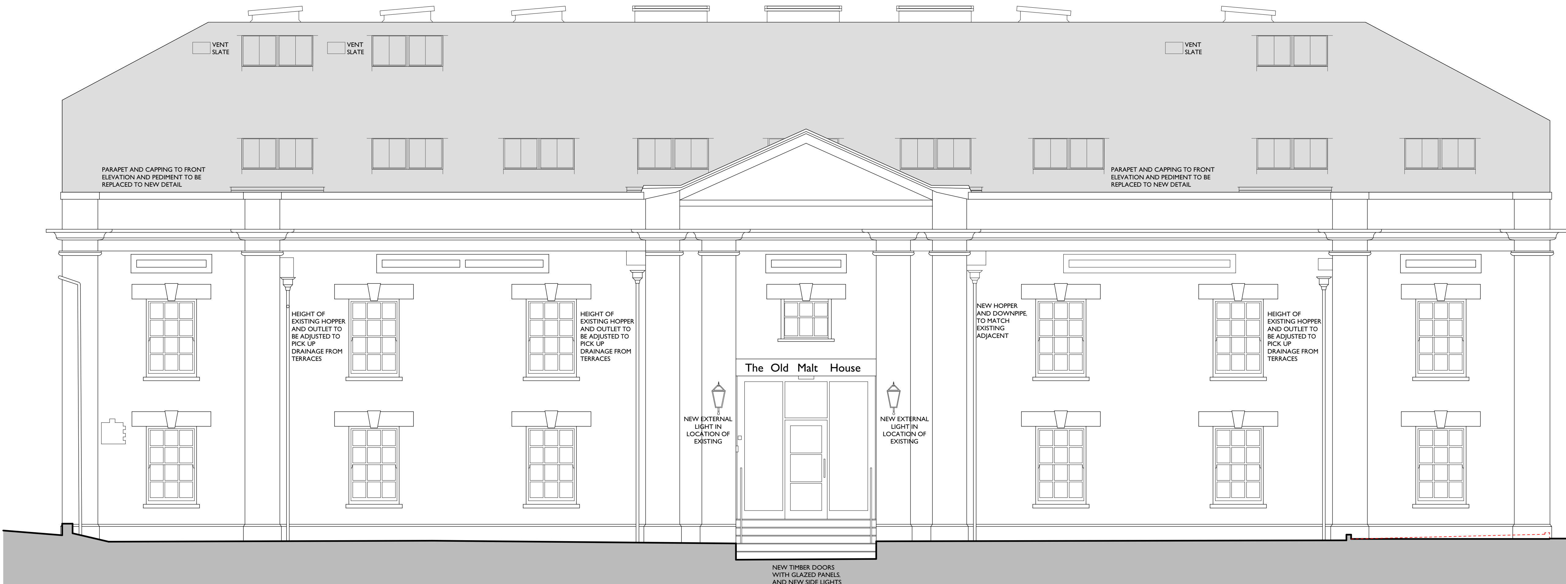
NORTH ELEVATION AS PROPOSED