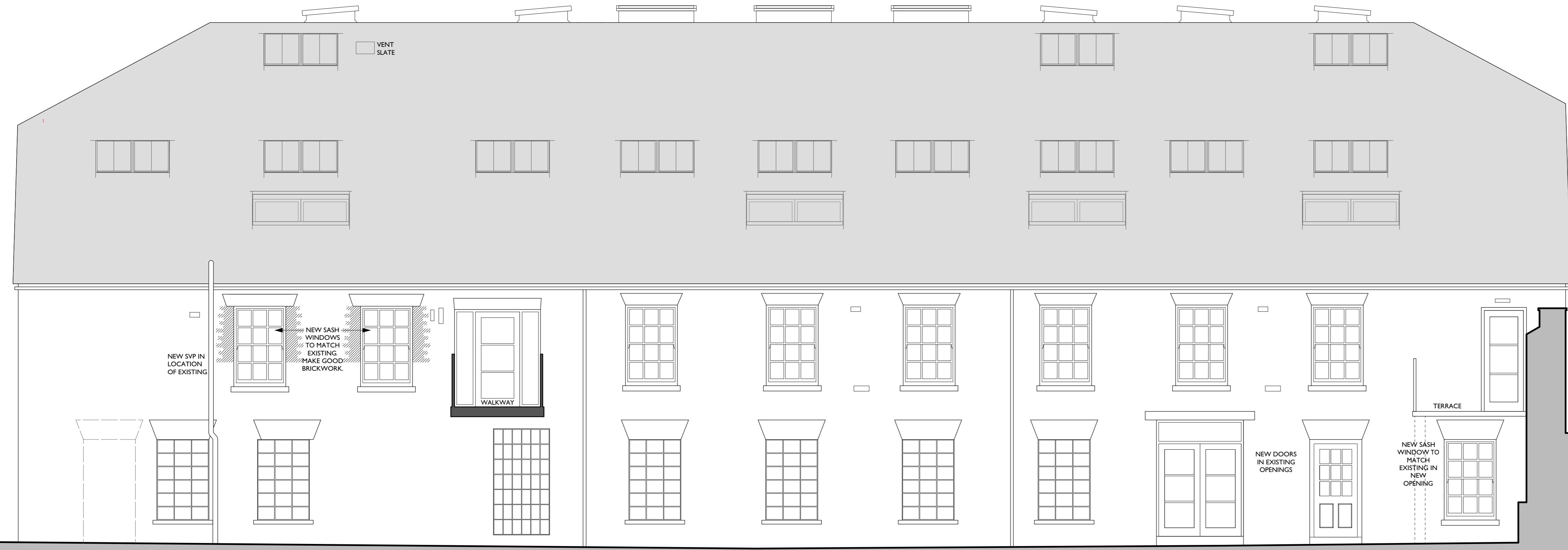
SOUTH ELEVATION AS PROPOSED