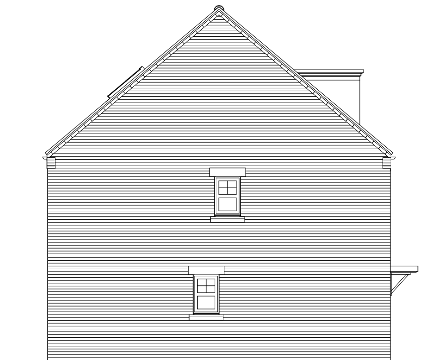
SIDE ELEVATION H: 287 AS: 284, 285, 288 & 289