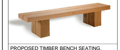
PROPOSED TIMBER BENCH SEATING. To be FSC hardwood, 'Woodscape Type 2' or equal approved. L2000 x W400 x H400mm.